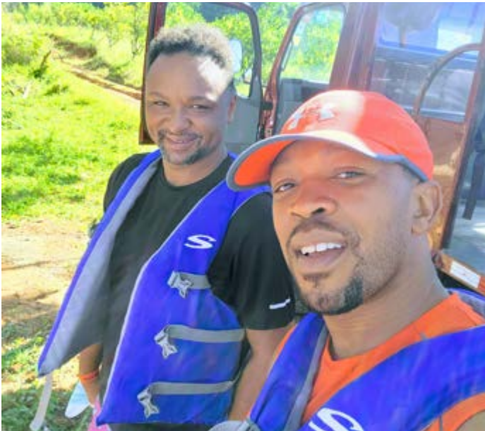
2021 vacation in Jamaica.