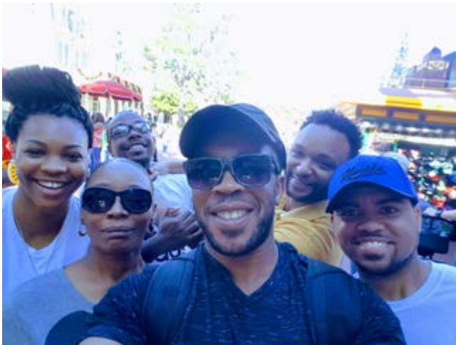
Family vacation to Disney World winter 2017.