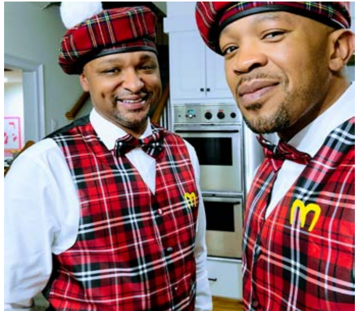
Halloween 2021 Coming to America-themed costume.