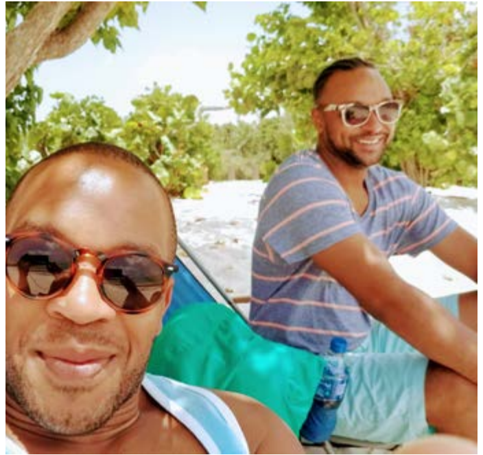
2022 vacation to Mexico and Honduras.