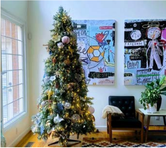
Our Christmas tree 2021.