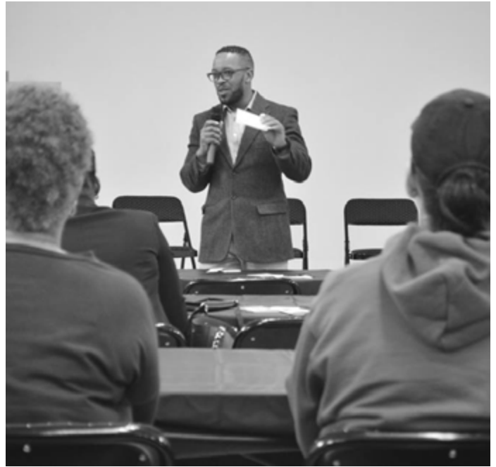
Seft leading a training with community members.