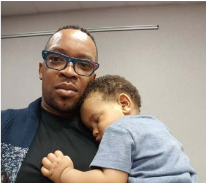
A little visitor stopped by Seft's office in 2017.