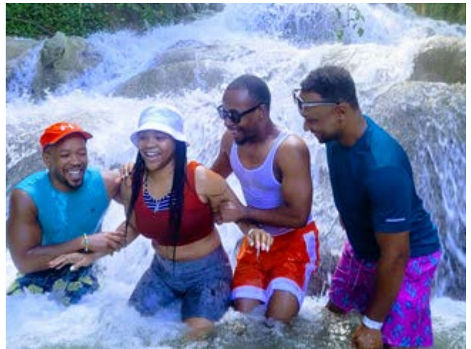
Family vacation in Jamaica Summer 2021.