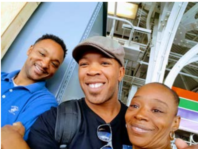
Family road trip to Chicago and Lincoln home 2016.