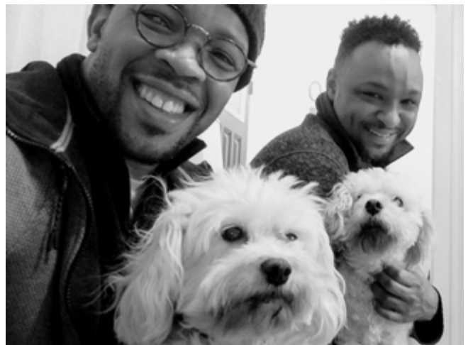
First night in our new GA home with our two furry friends.