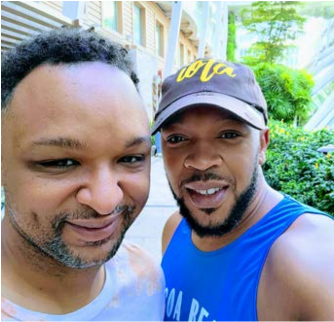
2018 vacation to St. Thomas, and St. John, USVI.