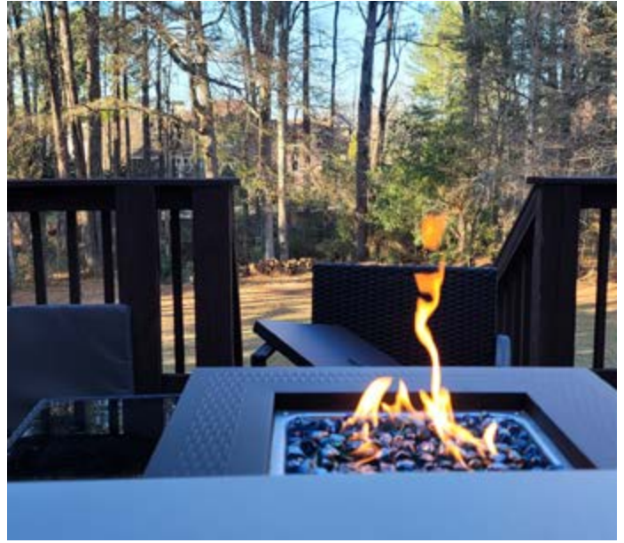
The view of our backyard in Spring 2022.