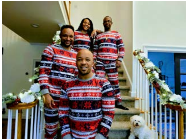
First Christmas in Georgia with family in 2019.