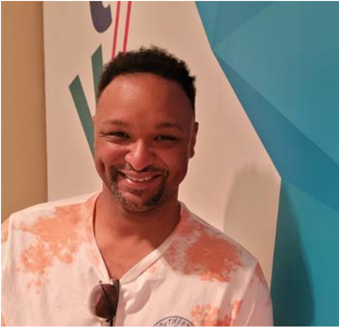
William visiting the Museum of the Americas in San Juan in 2021.