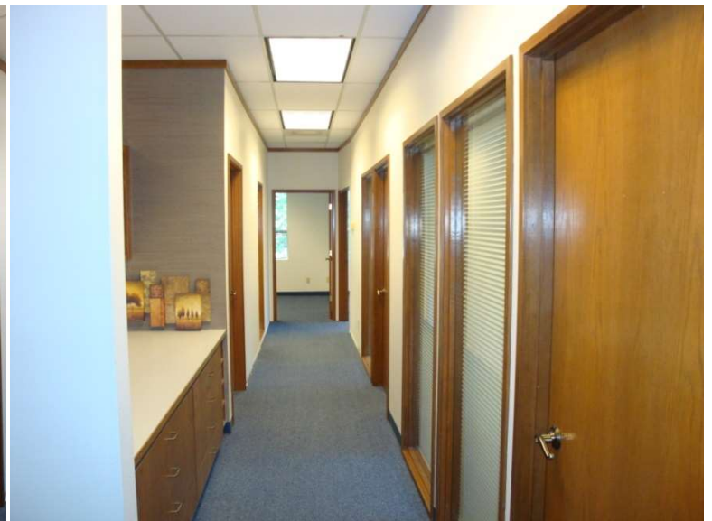
Suite 101 Office Area