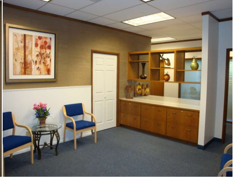
Suite 101 Furnished Waiting Room