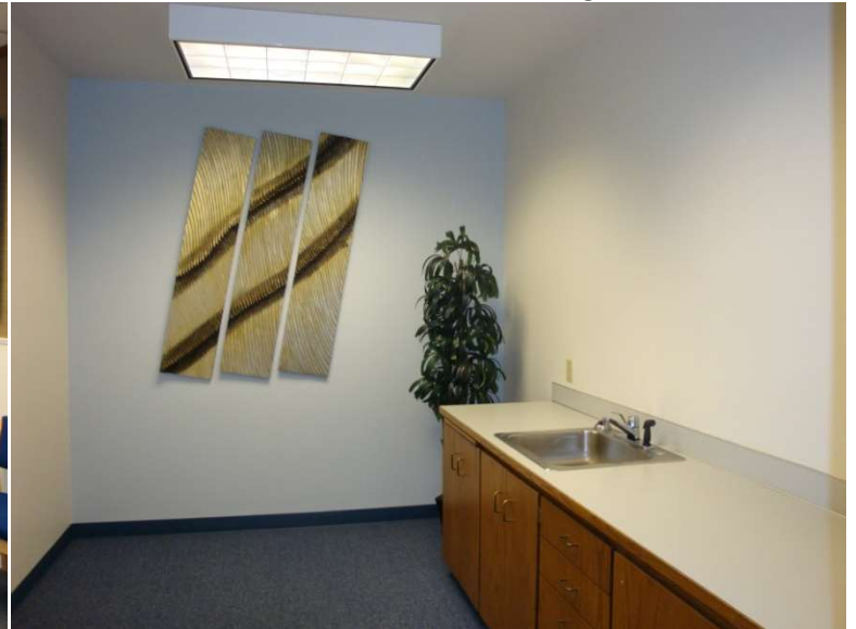
Suite 101 Break Room Small Conference