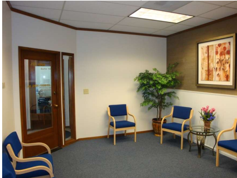
Suite 101 Furnished Waiting Room