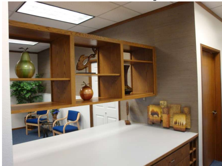
Suite 101 Office Area