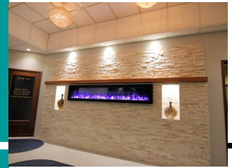
Silver Lake Professional Center

1710 * 1720 100Th PL. SE, Everett, WA. 98208 (Silver Lake Highway 527 )