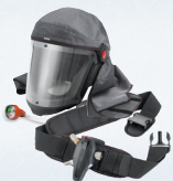
SATA air vision 5000 regulator set Compressed air-fed breathing protection equipment for use in combo with wall-mounted three-stage filter unit Part #1005603