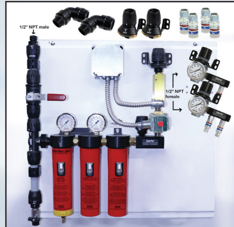
SATA/DanAmAir Filtration Panel for One Booth Part #801610