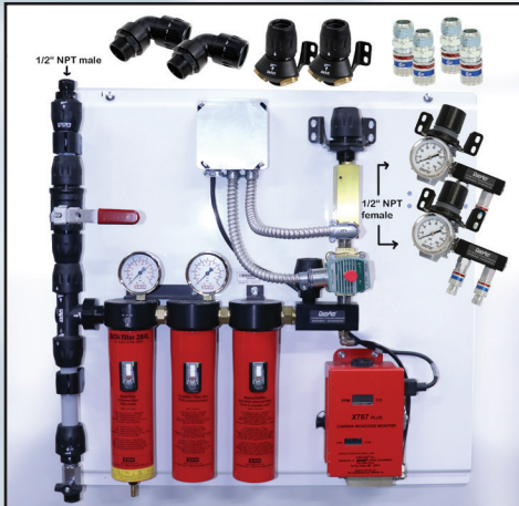
SATA/DanAmAir Filtration Panel for One Booth and Supplied Air Breathing Part #801612