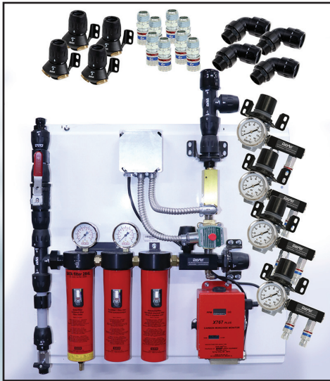
SATA/DanAmAir Filtration Panel for Two Booths and Supplied Air Breathing Part #801622