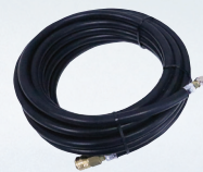
SATA Black Breathing Hoses Top quality hose for breathing air and air tools. 145 psi, NIOSH approved