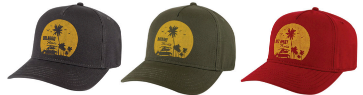
E-FLEX 1958 ISLAND RETREAT NAVY, CHARCOAL, OLIVE, RED