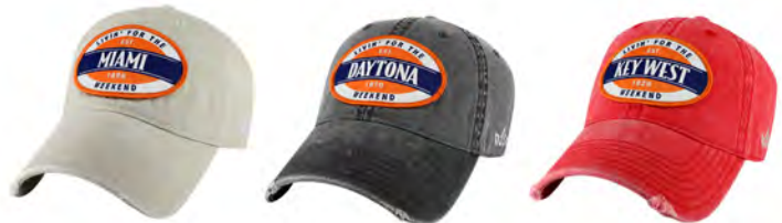
WEEKEND LIVIN' ESSENCIAL 1955 NAVY, GRAY, BLACK, RED