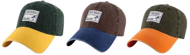
E-FLEX 1950 COLOR BLOCKED BLUE-RED, GREEN-YELLOW, BROWN-NAVY, ARMY GREEN-CORAL