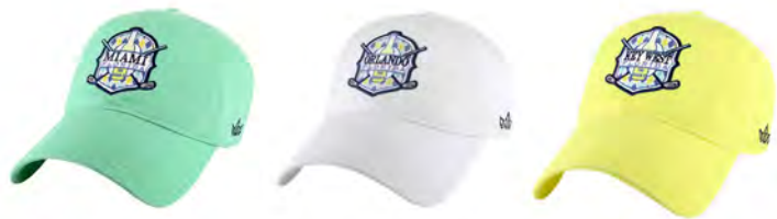
BACK 9 ESSENCIAL 1974 SKY BLUE, MINT, WHITE, PASTEL YELLOW