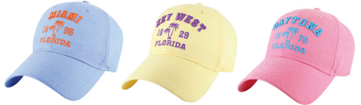
E-FLEX 1948 LIFESTYLE MINT, BLUE, YELLOW, PINK