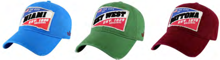
CITY PATCH ESSENCIAL 1953 BLACK, LAKE, GREEN, BURGUNDY