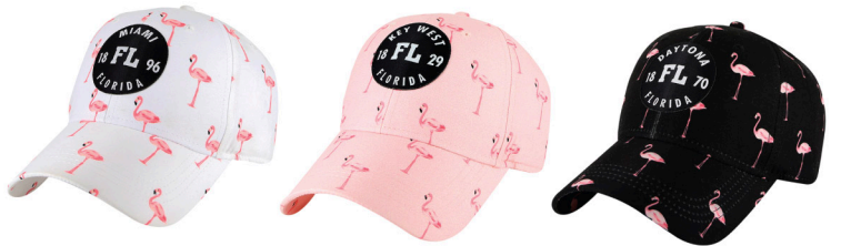
E-FLEX 1960 FLAMINGO LT. BLUE, WHITE, PINK, BLACK