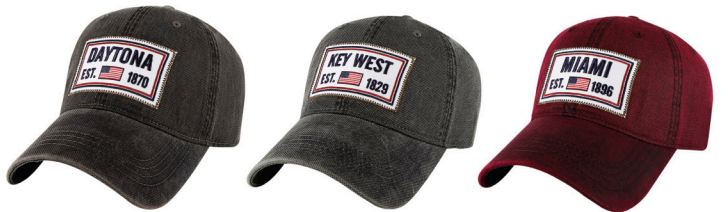
E-FLEX 1954 AMERICANA II NAVY, BLACK, DARK GRAY, BURGUNDY