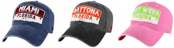
DOUBLE APPLIQUE ESSENCIAL 1952 YELLOW, NAVY, GREY, PINK