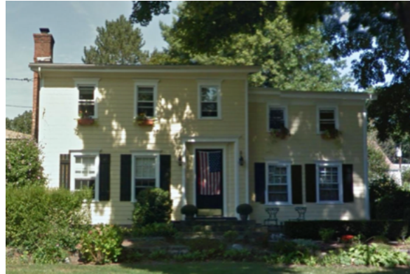
Abraham H Hopper House, 1 Nordam St., corner of Prospect St. Waldwick, NJ