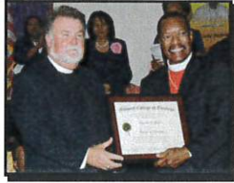
Dr. Charles E. Blake Presiding Bishop COGIC