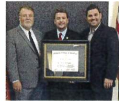
Sen. Jason Rapert AR State Senator