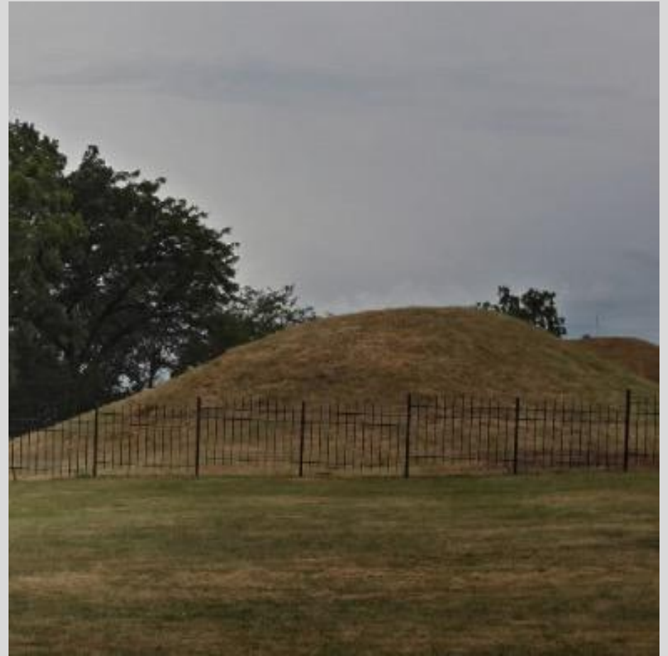
IMAGE OF INDIAN MOUND STATE PARK, ST. PAUL, MN

SADLY, THE MOUND WAS LEVELED IN 1852 WHEN THE CITY GRADED 7TH STREET. THE BURIAL MOUND