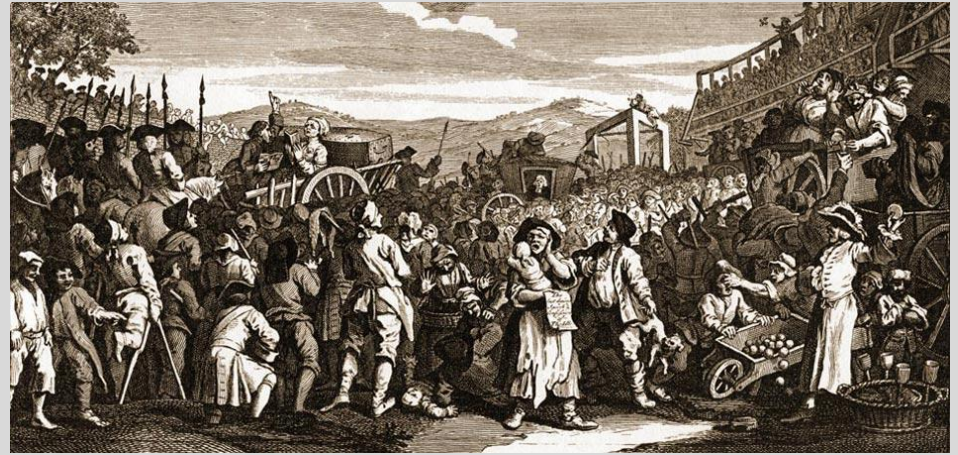
PROCESSION TO EXECUTION AT TYBURN, LONDON, ENGLAND

ONE MAN WAS MURDERED BY HIS DUBUQUE LEAD MINING PARTNER, DUBUQUE'S CITIZENS HELD A TRIAL, MAKING NATIONAL NEWS AS THE BLACK HAWK PURCHASE HAD NO LAWS FOR IT WAS NOT PART OF THE U.S. OR A TERRITORY. CONVICTED BY HIS PEERS, THE MURDER APPEALED, YET NO ONE HAD JURISDICTION, NOT EVEN PRESIDENT ANDREW JACKSON.