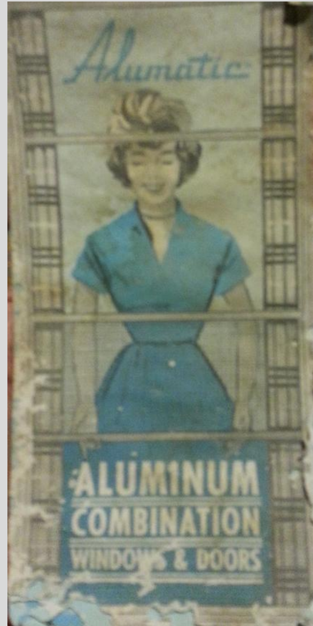
BURKE ALUMATIC WINDOWS & DOORS BROCHURE FOUND IN A WALL ON THE FIRST FLOOR

THESE ARE LAST BUILDINGS, OF THE FARLEY & LOETSCHER MILLWORK CAMPUS. F&L BOTH USED AND LEASED THIS BUILDING AND THE DAIRY'S FORMER GARAGE NEXT DOOR TO SEVERAL TENANTS, INCLUDING BURKE ALUMATIC, COUNTY RELIEF FOOD DISTRIBUTION, McCRAY'S CHICKS HATCHERY, AND THE BASEMENT WAS EVEN A FALLOUT SHELTER. F&L ADDED METAL WINDOWS, CUTTING INTO THE DAIRY'S GHOST SIGNS THAT ONCE COVERED MUCH OF THE BUILDING.