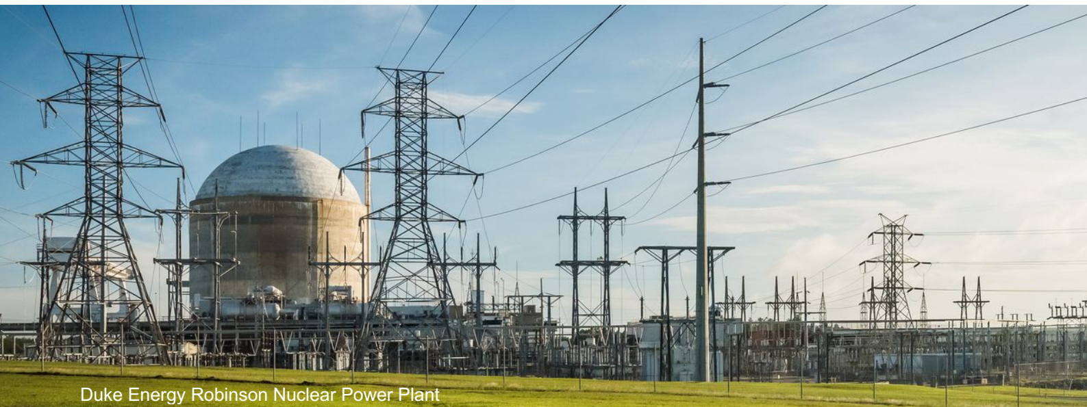
Duke Energy Robinson Nuclear Power Plant

Under the circumstances, ESS could propose building such Energy Centers (3 or 4 of them) at ESS's expense and receive a positive response from Duke Energy Progress, saving Duke the expense of the transmission upgrade, allowing them to simply manage their energy more efficiently.