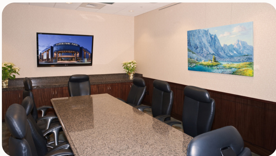
Board Room 2