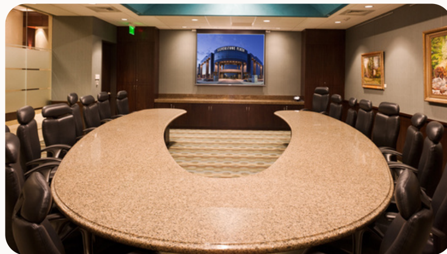
Board Room 1