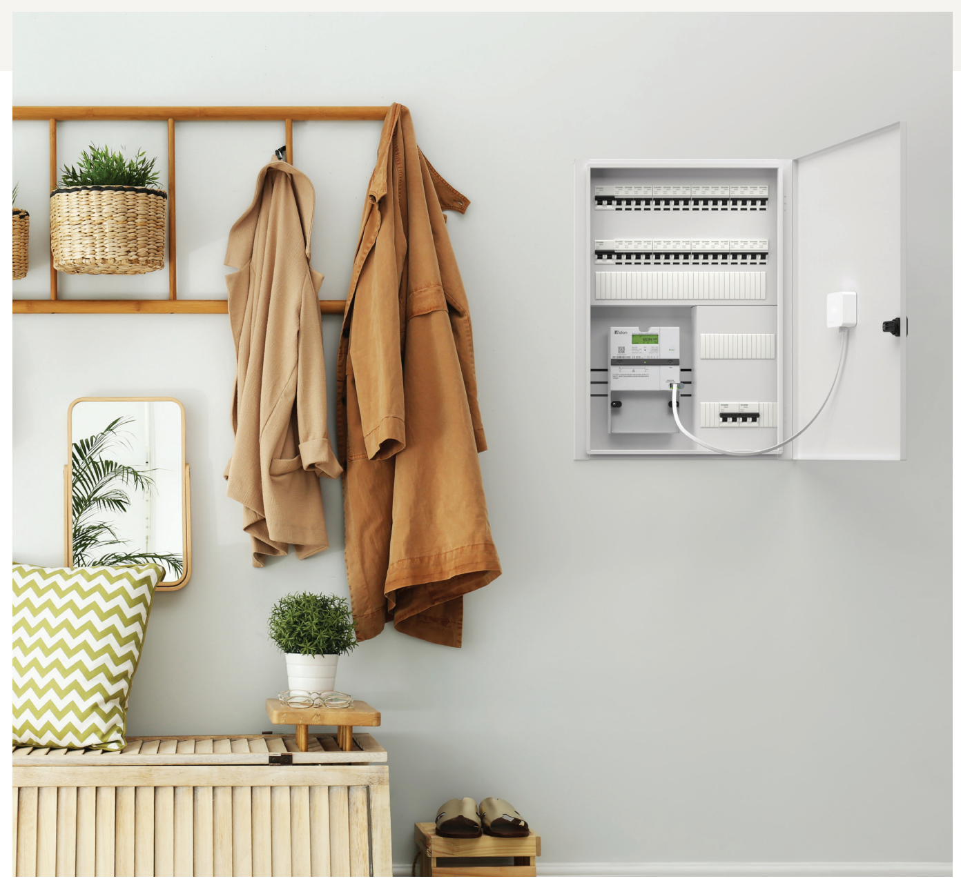
Zaptec Sense is small but smart and is placed inside the fusebox.

Zaptec Sense ensures even more power for electric vehicle charging than normal. You can charge more quickly and you can charge multiple vehicles at the same time, completely automatically.