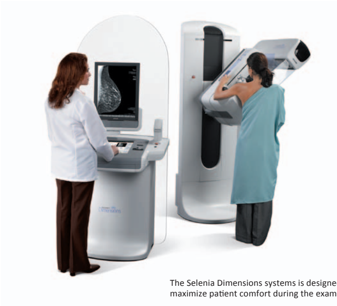
The Selenia Dimensions systems is designed to maximize patient comfort during the exam.