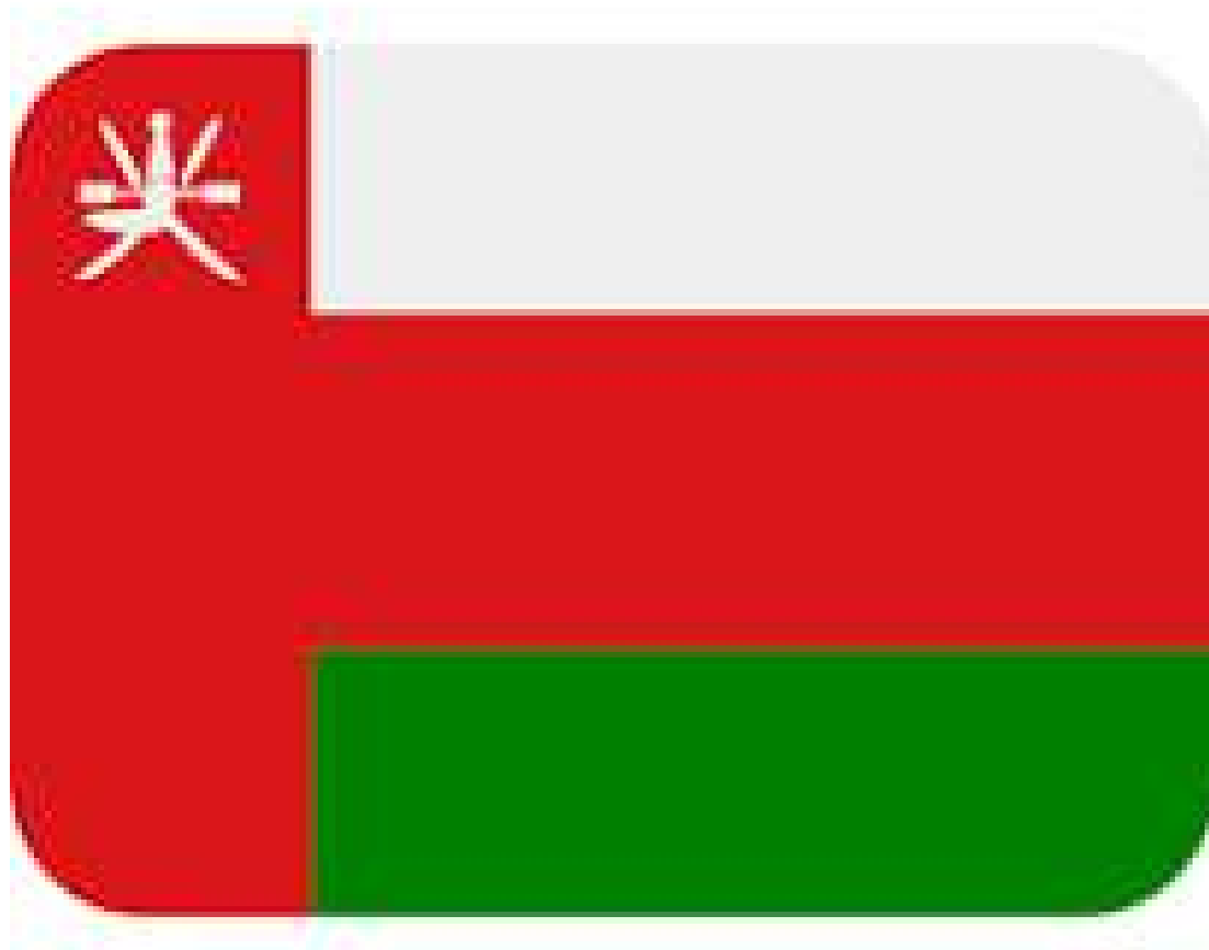
SULTANATE OF OMAN