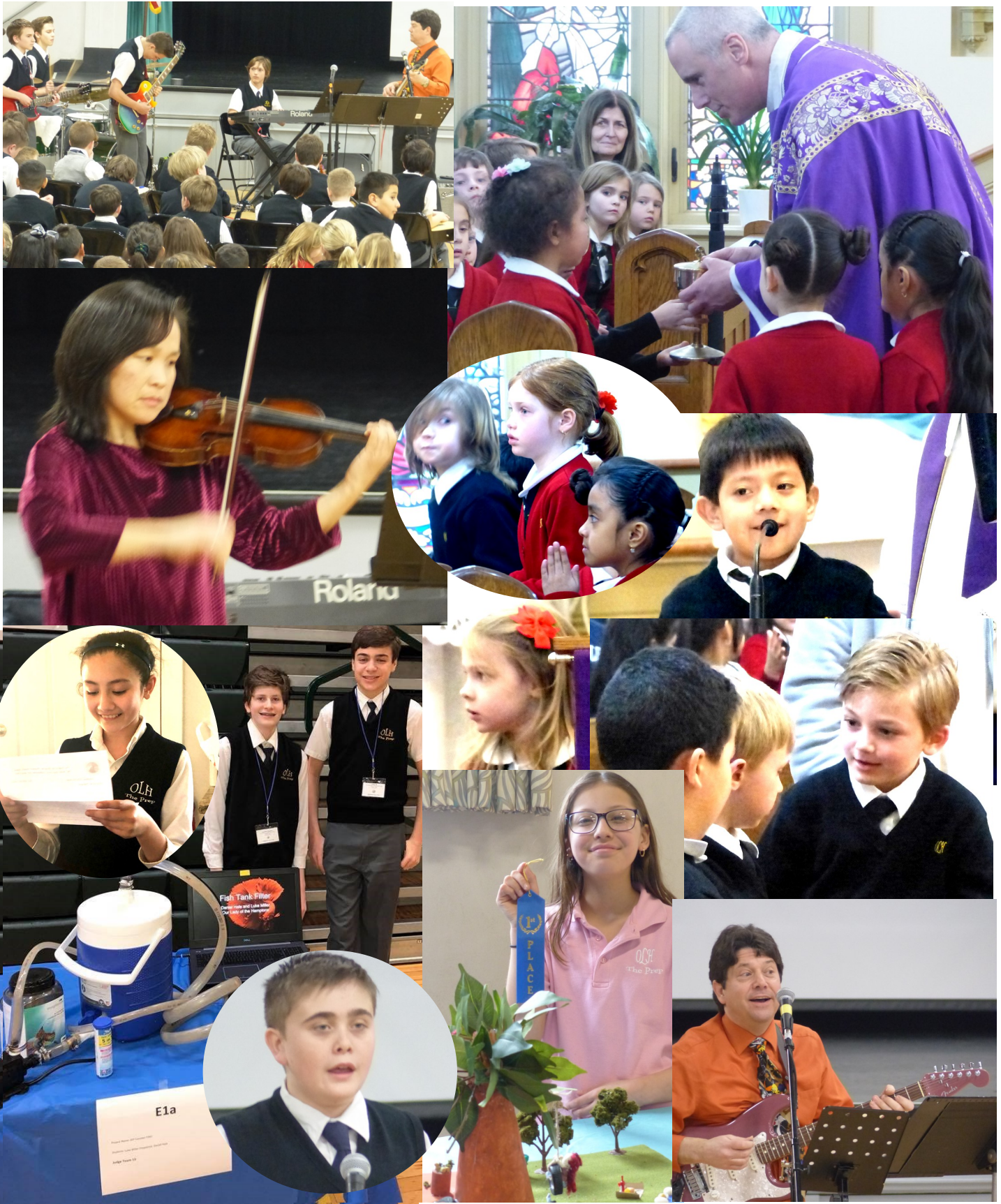
MORE SPRING SCENES FROM OLH