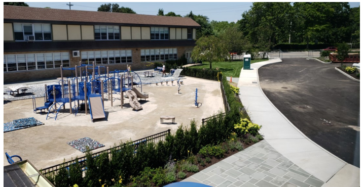
Playground installation showing the new egress onto Railroad Avenue...July 2019