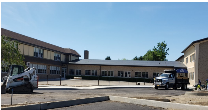
Areas are well-defined by May 2019- Fence posts show the play area