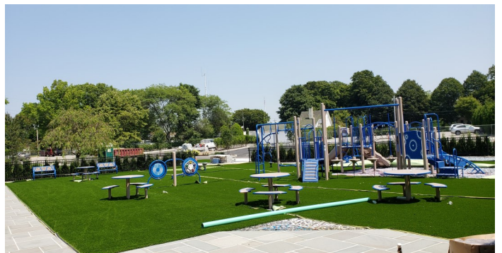
Installation of artificial turf surface-August 2019