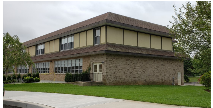
Natural grass and plantings restored to north entrance July 2019