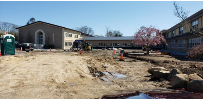
Construction and realignment of the parish parking lot/school yard began in February 2019