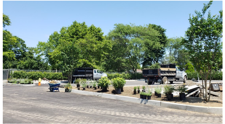
Landscape begins in June 2019