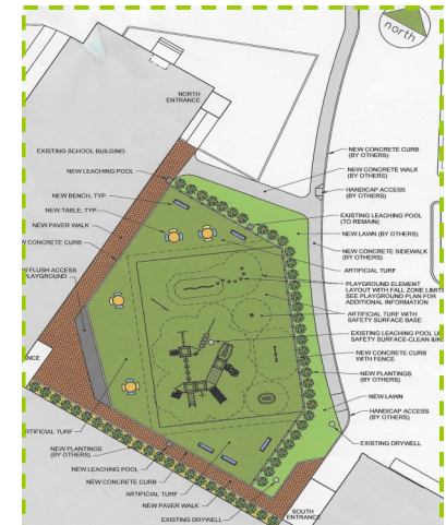
The plan as envisioned by OLH Dad and architect Shawn Leonard

In reality, the actual modifications to the site itself started in late February. All in all, six months later, we are almost ready to welcome our students back and share a safe, well-planned play area, ADA compliant equipment and access, gated security exits, expanded parking for the parish, a designated faculty parking area, and a well-planned landscape that completes the exterior of this school, helping everyone to see that Catholic education is alive and well here!