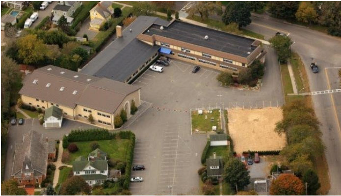
Aerial site plan (The sandy area at lower right was the property purchased in 2017)