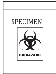
qty: 1 - 4"x 6" biohazard bag

Please use these instructions when preparing blocks for FedEx Overnight shipment Please review the instructions and contents of the kit before preparing the requested tumor samples