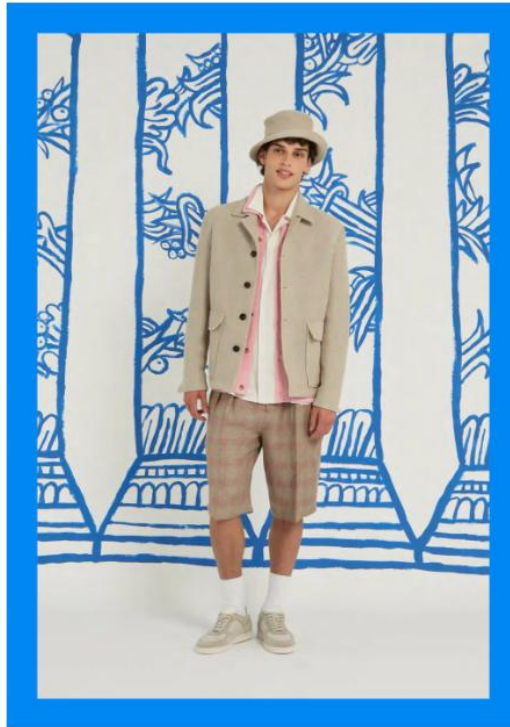
Harmont & Blaine men's spring 2026

There were plenty of shirt jacket options at Harmont & Blaine fitting different vibes, from the beige leno weave iteration worn with yarn-dyed Prince of Wales shorts and the linen blouson bearing subtle tone-on-tone herringbone patterns, both conjuring Italian Riviera chic, to the workwear-inspired Army green overshirt with collegiate patches, part of a spring drop hinged on the preppy look. The collection grew more colorful in new renditions of the signature striped shirts, here combining different stripe widths or in the "Postcard" capsule of camp collar shirts and beachwear bearing vintage-looking prints. In addition to its Earth Dye capsule hinged on the use of natural pigments, Harmont & Blaine developed the Re-Loved upcycling capsule in partnership with the Re-Jàvu Milano brand. The brand has recently rejigged its governance, naming Daniele Ondeglia its general manager with oversight on business development. The executive said the company grew single-digit last year and it is planning to scale up its digital and retail business to expand its international footprint. In July the Italian brand will open a second store in Miami and more units in Spain.