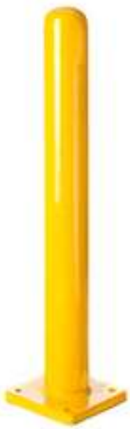
4" O.D. x 36", 42" or 48" on a 8" x 8" base plate 1/2" thick with four 3/4" corner holes