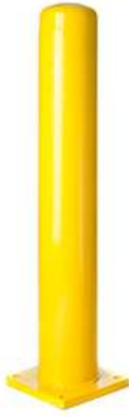
6" O.D. x 42" or 48" on a 10" x 12" base plate 1/2" thick with four 3/4" corner holes