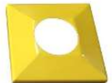
Base Cover Available