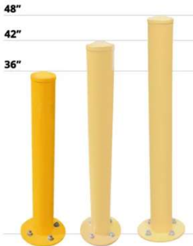
Round Base Available In 3 Heights