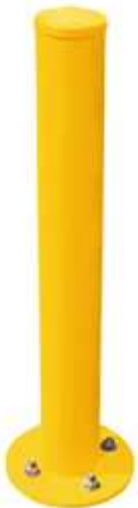
4 inch Diameter with Round Base