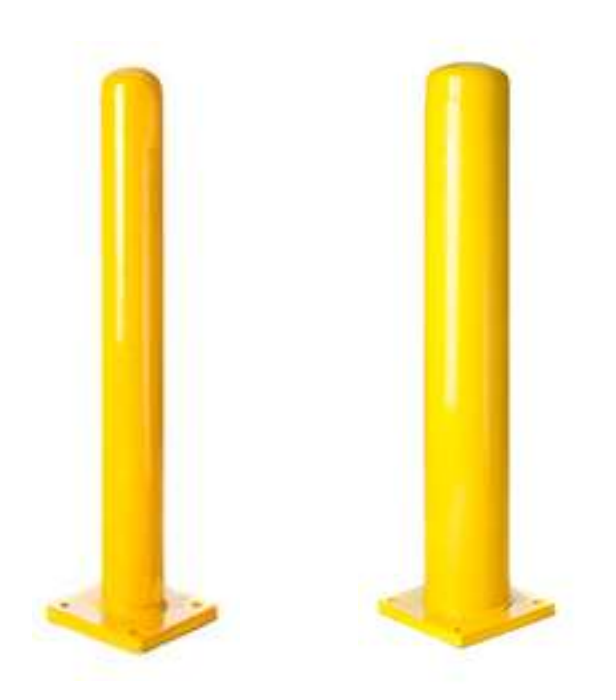
4" O.D. x 36", 42" or 48" on a 8" x 8" base plate 1/2" thick with four 3/4" corner holes