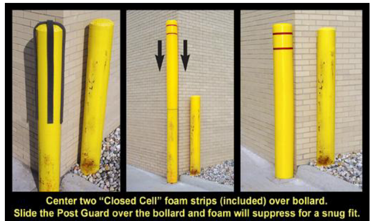
Center two “Closed Cell” foam strips (included) over bollard. Slide the Post Guard over the bollard and foam will suppress for a snug fit.

Post Guard bollard covers are not see-thru so they can be taller than the bollard. Simon recommends adding 2" to each measurement to assure the Post Guard completely covers the bollard. Simon can also custom cut each cover, at no additional charge, to make all of the posts appear to be the same height creating visual appeal and a uniform look throughout your property.