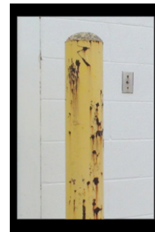
Rusty Bollard Post

All Post Guards are made using HDPE – High Density Polyethylene Plastic. These parts are thermoformed which means they are a solid color all the way through and they are strong enough to withstand minor impacts and harsh weather.