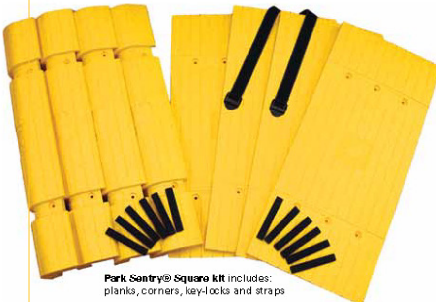
Park Sentry® Square kit includes: planks, corners, key-locks and straps