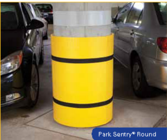
Park Sentry® Round