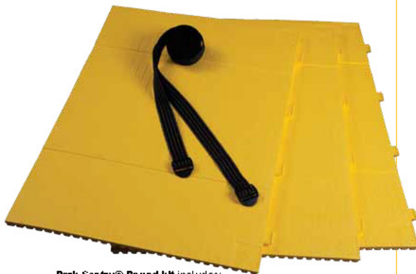
Park Sentry® Round kit includes: panels and straps