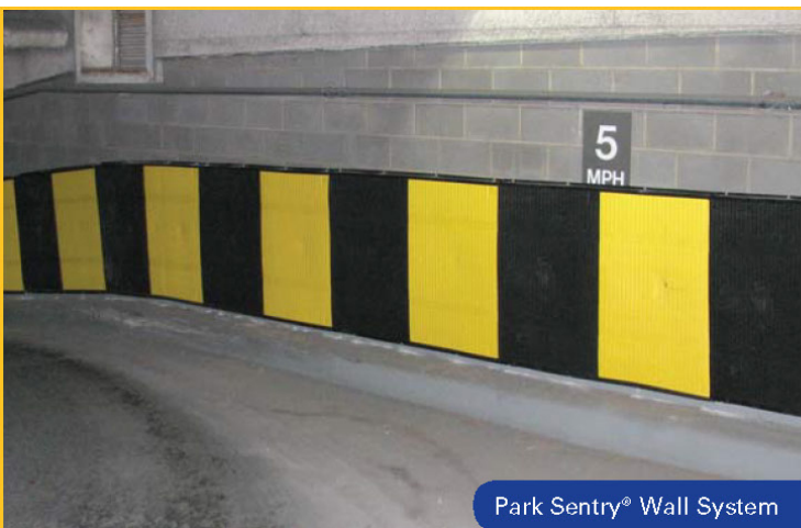
Park Sentry® Wall System

The Park Sentry Wall System provides a tough layer of protection to walls vulnerable to vehicle collision damage. Easy to install, the wall system adheres to the space using pre-mounted wall clips. Park Sentry products combine the scratch resistant properties of surface protectors with energy absorbing materials to form a comprehensive damage reduction system.