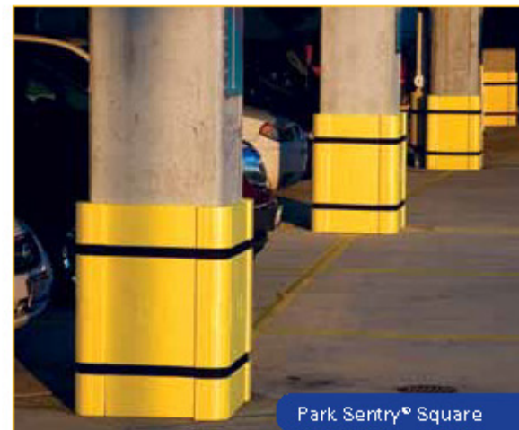
Park Sentry® Square