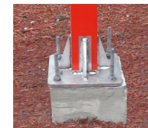
Clearance Structure Mounting

Specifications: Overall Dimension: 10' x 10' Horizontal Beam: 2" x 5" Mounting Plate: 11-3/4" x 11-3/4" x 1/2"