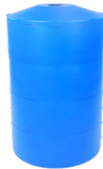
Poletector 540XL For use with 25" to 34" round or 24" square light pole cement bases.