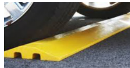
Plastic Speed Bumps

The Bumpie Alley Bump is higher to assure the reduction of vehicle speed. Channels effectively protect cables, pipes and electrical wiring.