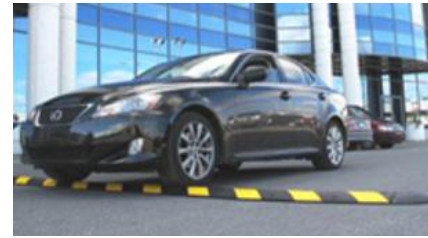
Safety-Striped Rubber Speed Bumps

Rubber Speed Bump reduces vehicle speeds making parking lots and residential streets safer for pedestrians and motorists.