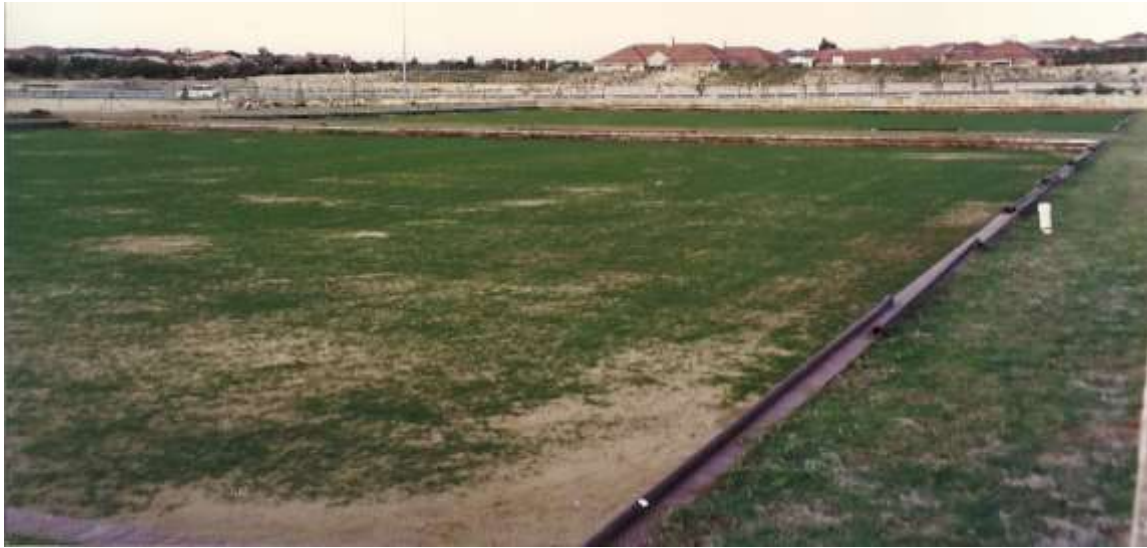
*Both greens starting to show growth, looking towards Marmion Avenue