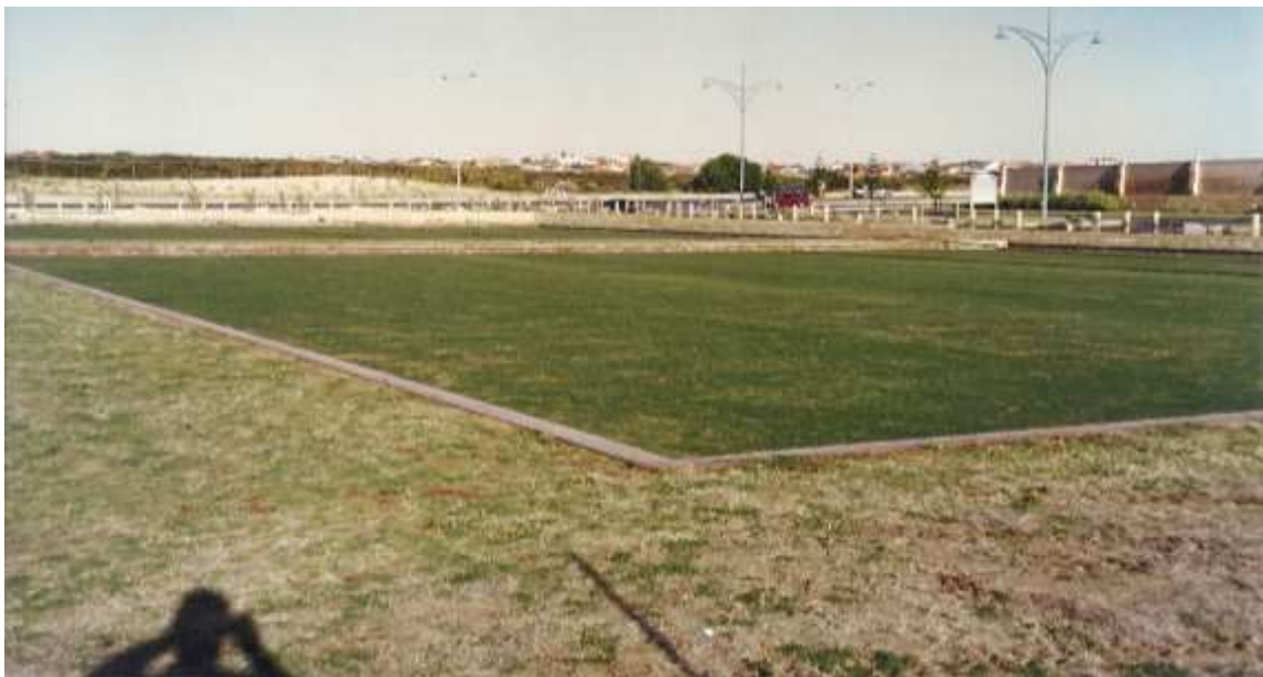
*Both greens coverage progressing satisfactorily and on track to be accepted by Bowls WA