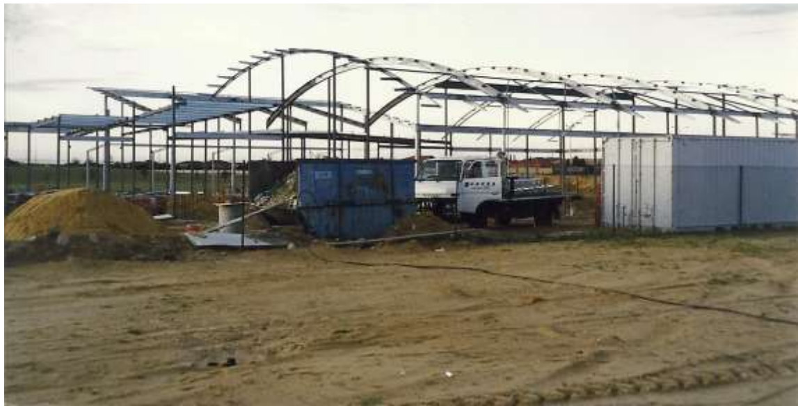
*This view of the Clubhouse looking from the facility's car-park