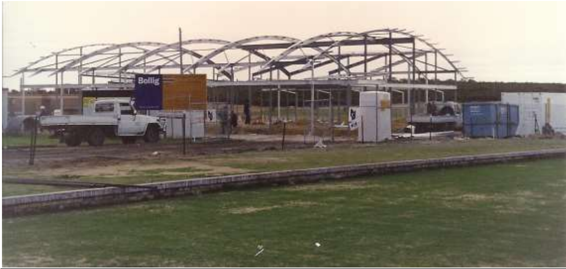
*A structural view of the Clubhouse looking from the now "B" green