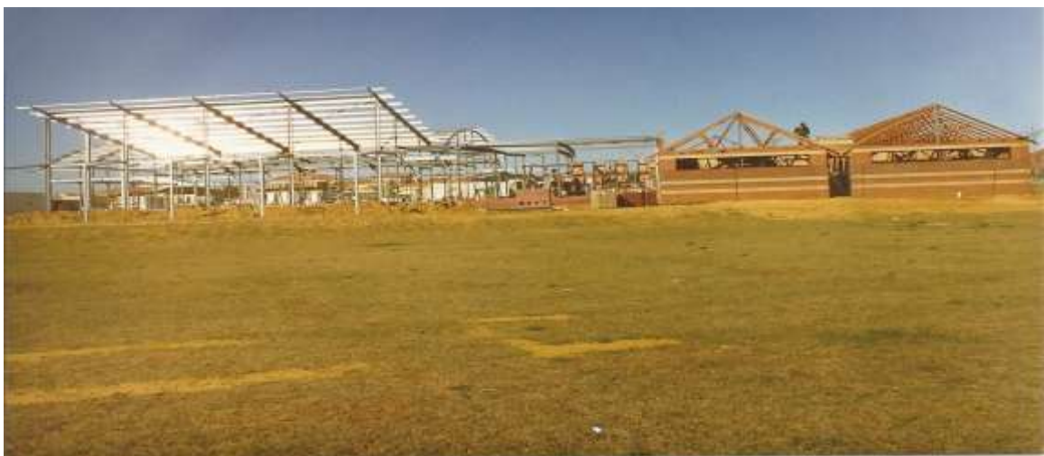
*The Clubhouse as viewed from the Complex's ovals