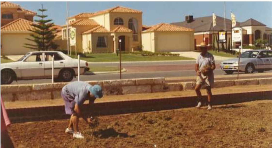
*Club members spreading National Park turf stolons on the now "B" green