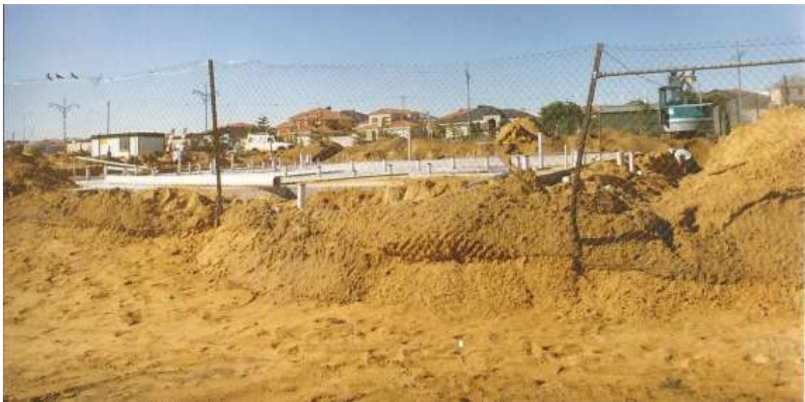
*Clubhouse concrete slab and site looking towards Miami Beach Promenade