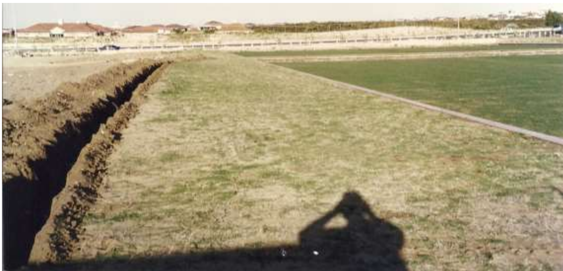
*Trench for reticulation on the northern side of greens. Marmion Avenue is in the background