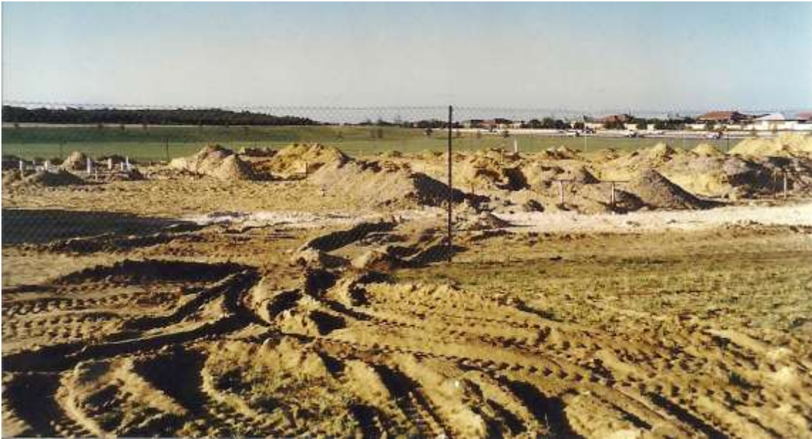
*Clubhouse site viewing from Miami Beach Promenade looking towards ovals