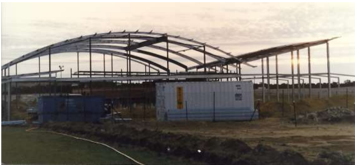
*Another view of the Clubhouse as seen from the now "A" green