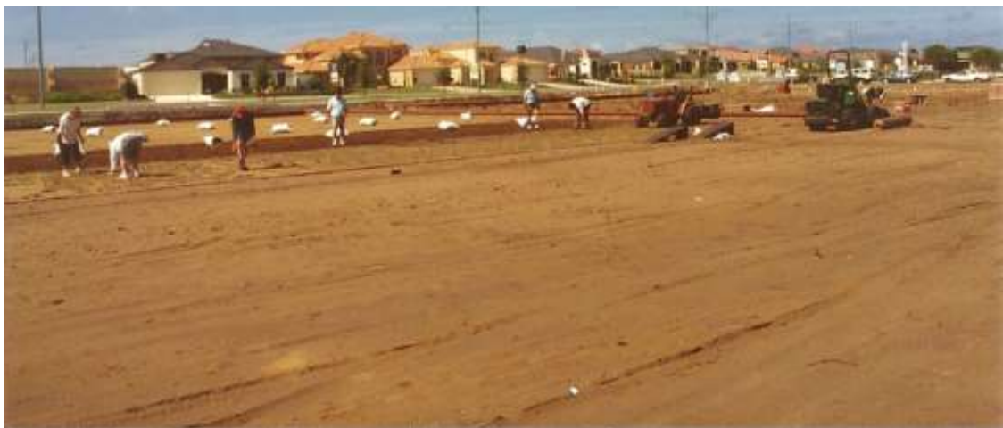
*Bill Goddard and Club members spreading National Park turf stolons on the now "C" green