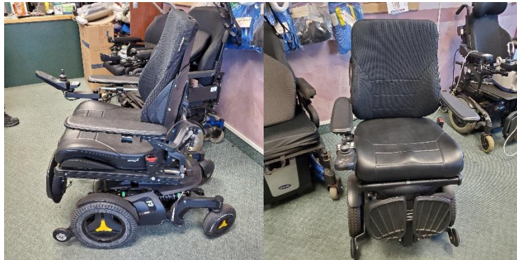
Invacare TDX SP, Blue, Mid-Wheel Drive