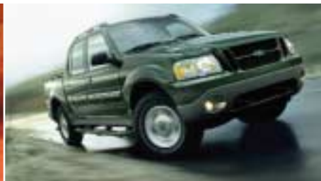
EXPLORER SPORT TRAC