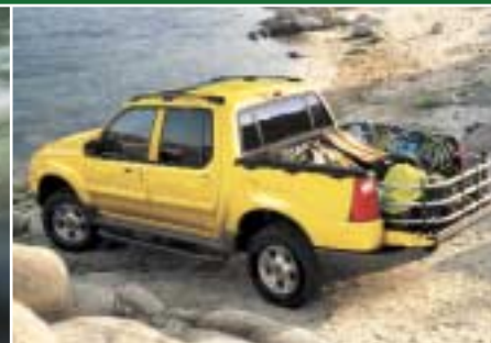
EXPLORER SPORT TRAC

The innovative 4-door Explorer Sport Trac combines the comfort and convenience of an SUV with the added utility of a flexible, open cargo area for “one vehicle does it all” versatility. Rugged, athletic styling shared with the Sport model makes Sport Trac the most versatile and active model in the Explorer lineup.