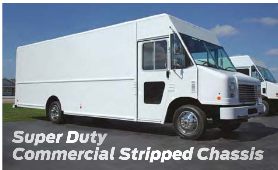
Super Duty Commercial Stripped Chassis