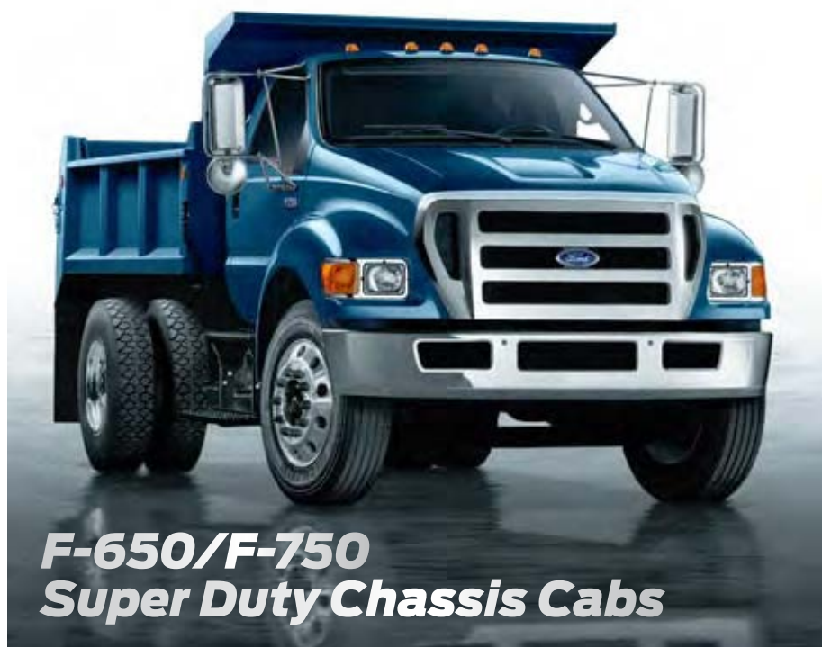
F-650/F-750 Super Duty Chassis Cabs