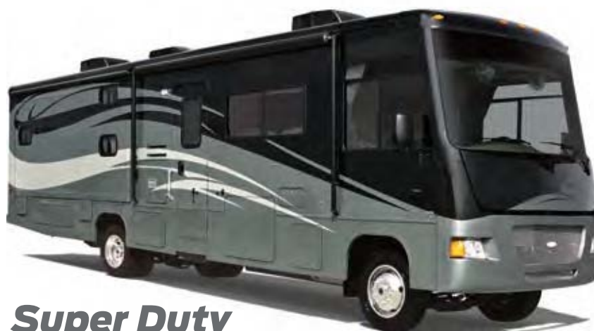
Super Duty Class A Motorhome Chassis

Note: Towing vehicle's braking system is rated for operation at GVWR – NOT GCWR. Separate functional brake systems should be used for safe control of towed vehicles or trailers weighing more than 1,500 lbs. when loaded.