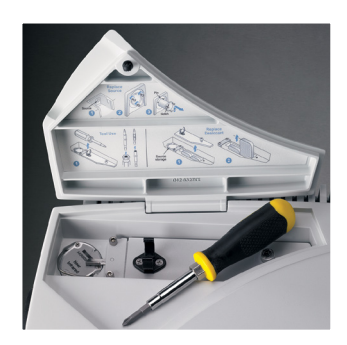
Optional tungsten halogen source and desiccant compartment are easily accessible