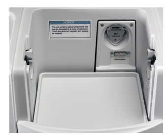
The Nicolet iS20 source is mounted in the sample compartment, allowing quick and easy optimization of data collection