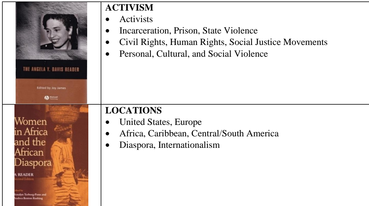
BWST Booklist TIDAL Theme Table