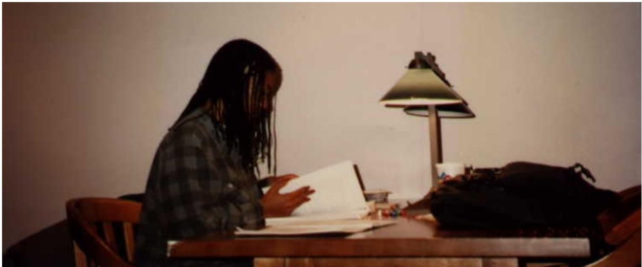
SYE @ St. John's College Library, 1994

Certainly, the personal, social, and structural violence that Black women face can be challenged with a deeper understanding of the systems in which we operate. Praxis is required, both theory and action, in order to transform our world. The field of Black women's studies is a vital part of that process of social change. As I complete this project of public scholarship, my social media timelines are literally brimming with news of violence against Black women. As a survivor of several types of violence, I write with a keen awareness that my agenda with the BWST Booklist is not only to change narratives, but also to change policy, practice, culture, and the social systems that oppress Black women.