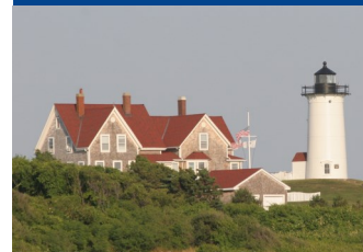
Lighthouse overlooking Vineyard Sound