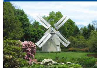
One of Cape Cod's many Windmills

$100 Due Upon Signing. *Price per person, based on double occupancy.