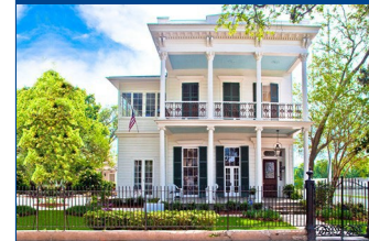
Visit the Free People of Color Museum