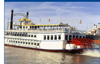
Enjoy a Riverboat Cruise

Departure: BWI airport arriving in New Orleans International Airport