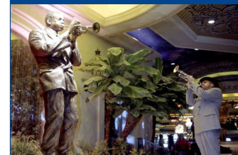
New Orleans - "Birthplace of Jazz"