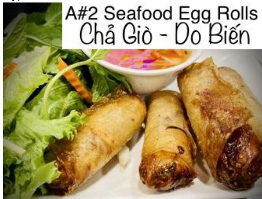
A#2 Seafood Egg Rolls Chả Giò - Đồ Biển

(Fresh crab meat, shrimp ground with mushrooms, carrot, bean noodles wrap in a Rice paper Wrap and Deep fry)