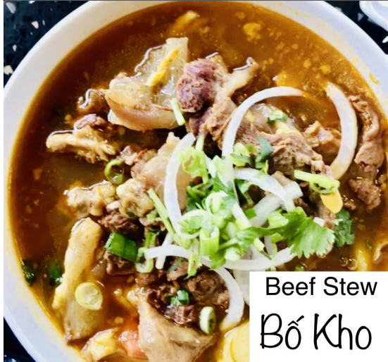
Beef Stew Bổ Kho

B1, B2, B3. (Comes with a side of raw bean sprouts, basil, jalapeño, limes/lemon)