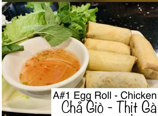
A#1 Egg Roll - Chicken Chả Giò - Thịt Gà

(Ground Chicken, mushrooms, carrot and bean noodles wrap in egg wrap and deep fry)