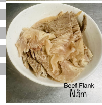
Beef Flank Nạm