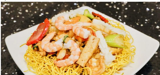
C#7 House Special Pan-Fry Noodles Mi Áp Chào Đặc Biệt