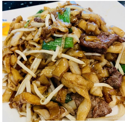
C#6 Beef W/ Chow Fun Hủ Tiếu Xào Bối