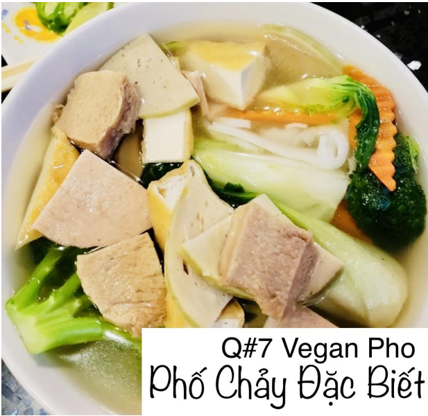
Q#7 Vegan Pho Phở Chả Đặc Biệt