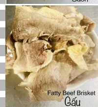
Fatty Beef Brisket Gầu