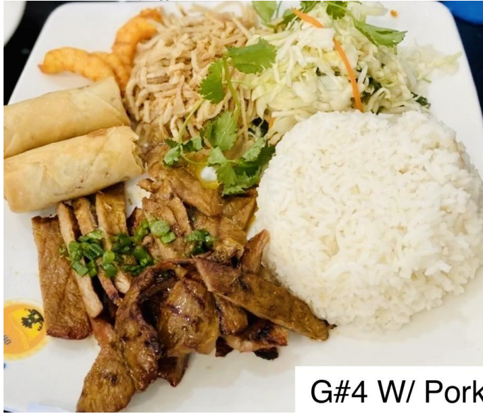
G#4 W/ Pork

Grill Meat, Pork Skin, Shrimp, Egg Roll w/ Rice