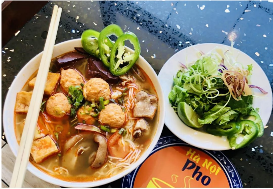
N#3 Crab Paste Vermicelli Noodles Soup.