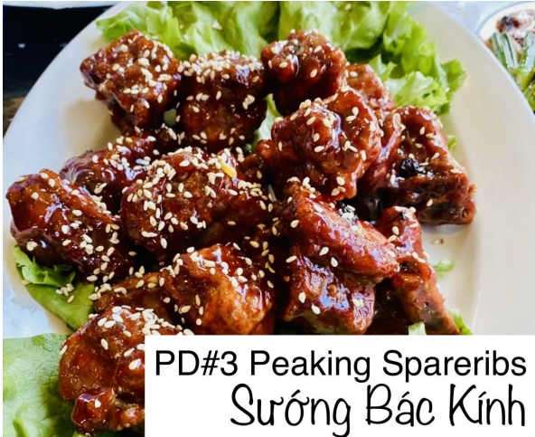
PD#3 Peeking Spareribs Sườn Bắc Kinh

(Fry Pork Rib in Sweet Plum Sauce top W/ Sesame Seeds)