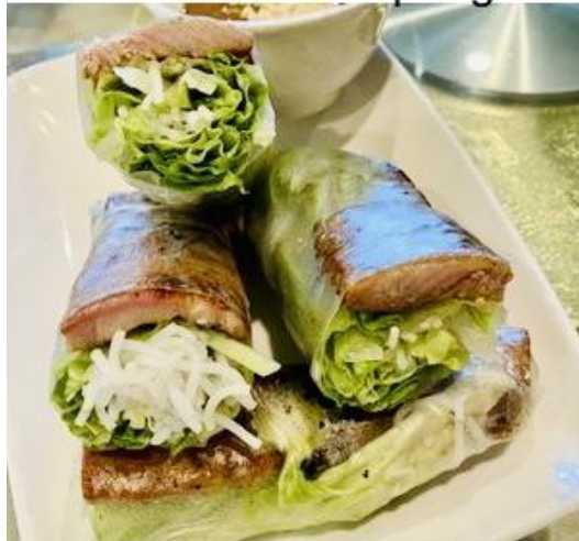
Gỏi Cuốn - Thịt Hèo Nướng