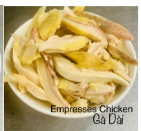
Empresses Chicken Gà Dài