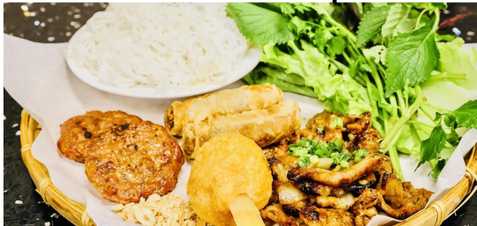
V#9 Hanoi Vermicelli Combo 3