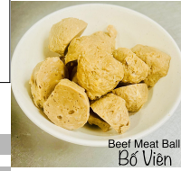
Beef Meat Ball Bò Viên