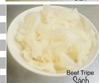
Beef Tripe Sách