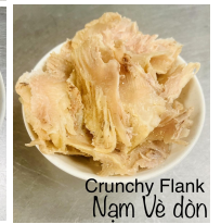
Crunchy Flank Nạm Vè dòn