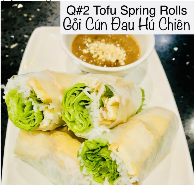
Q#2 Tofu Spring Rolls Gỏi Cún Đậu Hú Chiên

(Fry Tofu Wrapped With lettuce & Mints W/ a Fresh Rice Paper Wrap)