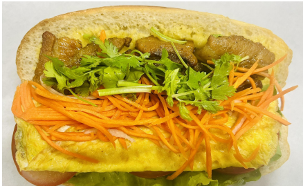
BM#5 Egg with Vietnamese Banh Mi Trung Thit Ba Chi