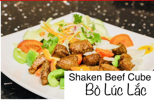
Shaken Beef Cube Bò Lúc Lắc