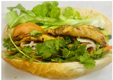
BM#10 Grilled Pork Pork Marinated in a Savory Lemon Grass Sauce