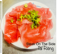
Steak On The Side Tái Riêng