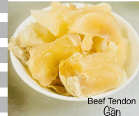
Beef Tendon Gân