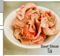
Beef Steak Tái

* Served raw or Undercooked or Contains raw or undercooked ingredients. * Consuming Undercooked Meats, Poultry, Seafood, Shellfish & Eggs. May increase your risk of food borne illnesses. Especially if you have certain medical conditions.