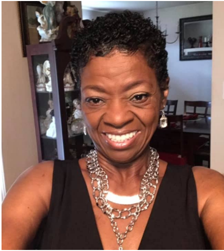
"Young ladies who have encountered sexual abuse as a child"