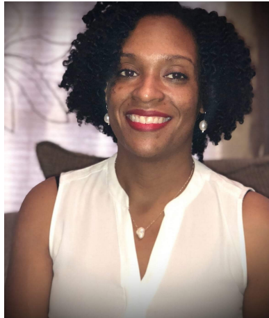
Running and exercise in my daily routine

What is one of the best digital tools ever invented?