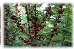
Nanking Cherry Bush

Tons of showy, white flowers with a pink blush, produced in early spring before leaves appear. Tasty, red 1/3" fruits make excellent jams/jellies or may be eaten fresh. Wildlife also love the fruit, a great conservation plant.