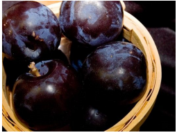
Blacklice Plum An early ripening, hardy fruit