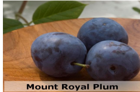
Mount Royal Plum