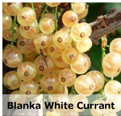
Blanka White Currant