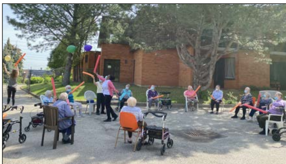
Volunteers from Durham College, during our “Happy Morning” program