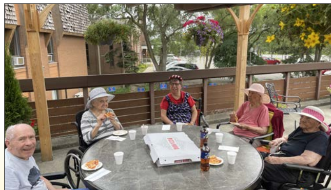
Residents enjoying pizza under our new pergola

Квіти – одне з найкращих творінь природи, вони милують нас своєю красою, ніжністю та дарують нам радість. Кожного року ми декоруємо наш Пансіон різнобарвними квітами, щоб милуватися їхньою унікальною та неповторною красою. Наші мешканці з насолодою беруть участь у прикрашанні свого дому та догляді за квітами.