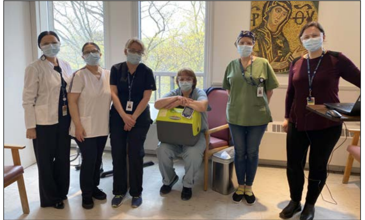
IFH staff getting ready for our in-house vaccination clinic

A big thank you to our community partner, Unity Health- St Joseph's Health Centre, for facilitating onsite vaccination for our staff members, and for their continuous support throughout the vaccination process.