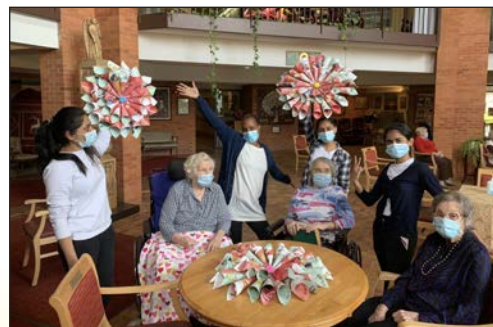
Volunteers from Sheridan College during an arts & craft program with our residents