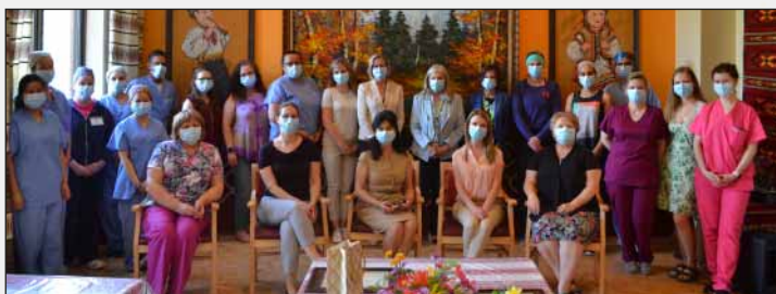
The Ivan Franko Homes and Halton Healthcare teams

THANK YOU IVAN FRANKO HOMES FRONTLINE WORKERS!