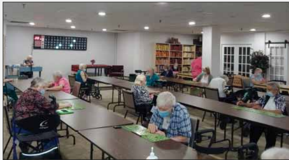
IFH residents, Mississauga during activities: Art Therapy Classes and Bingo

Thank you for all of your understanding during this most stressful time. If we continue to stay positive and supportive, together, we will weather this storm!