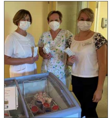
IFH Staff enjoying an ice cream break

Your tasty donation is appreciated, especially on a hot summer day.