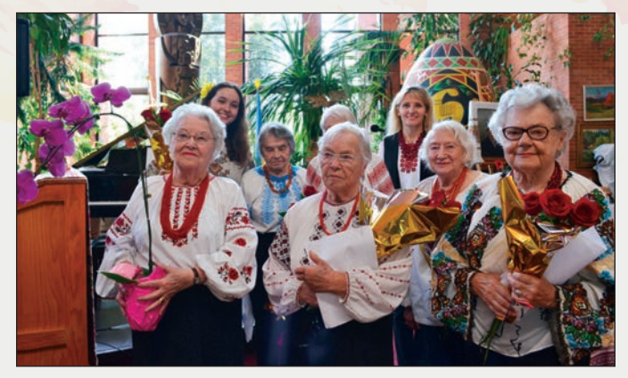
"Kalyna" singing group

Similarly, the tremendous difficulties faced by our first Board were compared to the struggles of Franko's "kamenyari". It was a long and difficult road that had to be traversed by the volunteers who envisioned a Home that would accommodate Ukrainian-Canadian seniors in a traditional cultural environment. From 1957, when the organization was incorporated as a charitable institution, until the opening of its first Home in 1964, the tremendous fund-raising efforts of the volunteers brought only $8,370.00 in donations. Some people donated $0.50 cents or $1.00, others turned away the devoted volunteers, stating