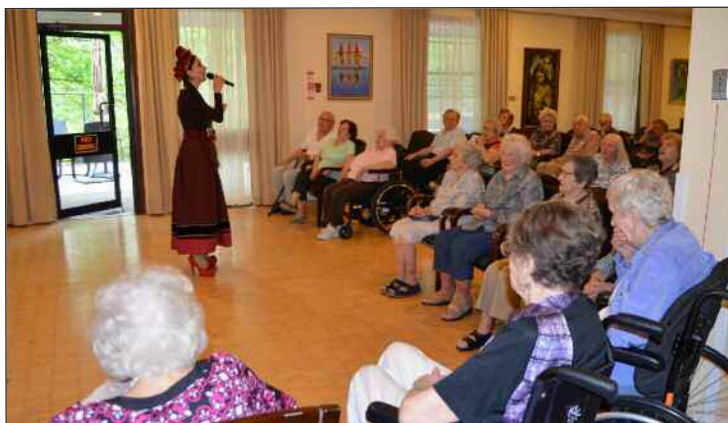
In September, residents of IFH (Toronto) were visited by Ruslana Lotsman, a widely-known singer from Ukraine