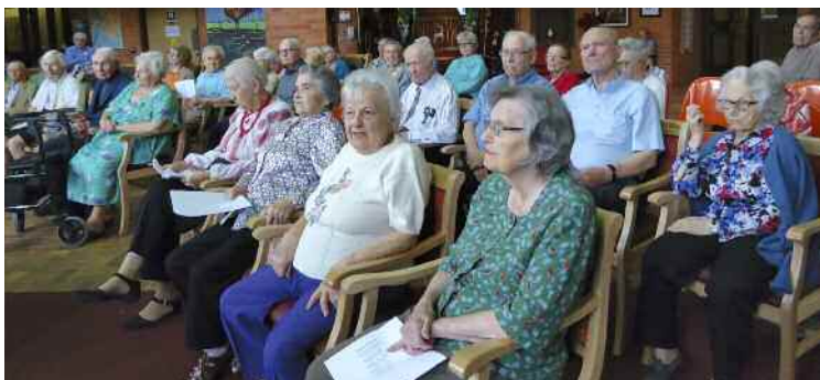
Під час однієї з наших імпрез. Мешканці Пансіону сидять на кріслах, придбаних під час кампанії „Seat Sale”.