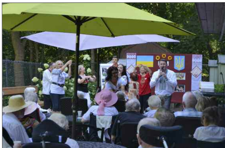
Свято Незалежності в Пансіоні ім. Івана Франка (Торонто)

Зберігаючи свою духовну спадщину, культуру і традиції, Пансіони ім. Івана Франка відсвяткували день Незалежності України 24 серпня 2018 року. До щорічного свята натхненно і добросовісно готувалися як мешканці, так і працівники. Кольорові вишиванки, українські пісні та танці відтворили український колорит та нашу ідентичність далеко від рідної Батьківщини.