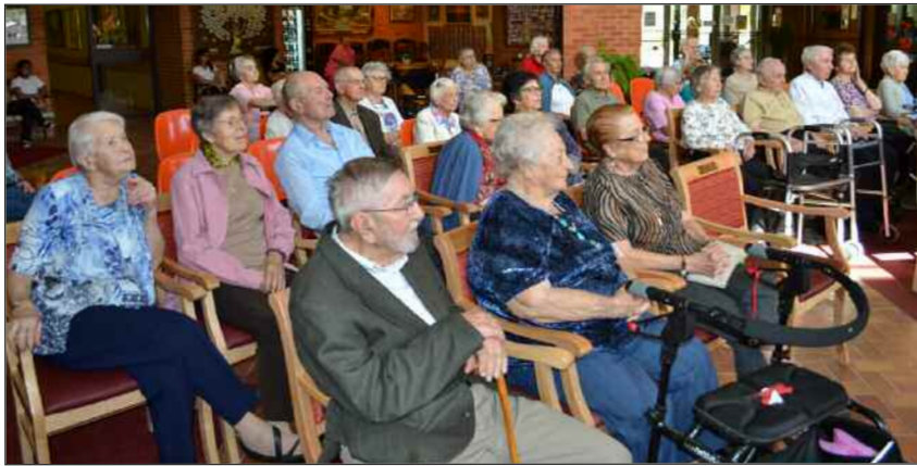
Residents of the Ivan Franko Home (Mississauga) during the event