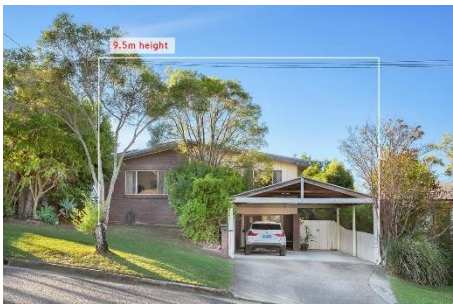
124 The Promenade Camp Hill