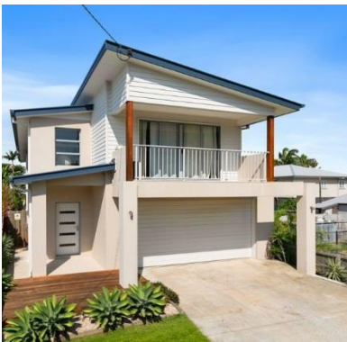
48 Bellevue Parade Lota