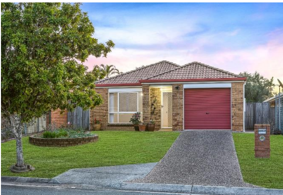
12 Magdalene St, Wynnum West