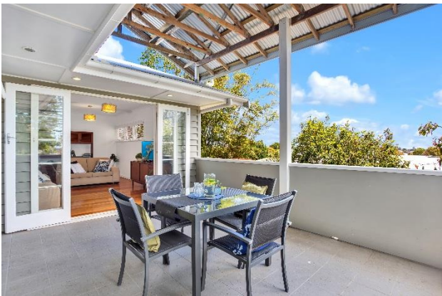
48 Blackwood Rd, Manly West

I would recommend Maude to anyone wishing to sell or buy as she offers a tailored personal approach and makes sure are you kept informed and are able to achieve the best possible outcome.