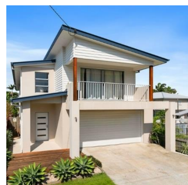
48 Bellevue Parade Lota