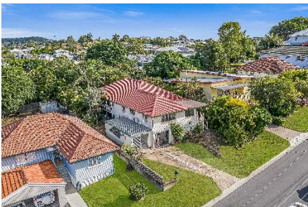
8 Quebec Ave Camp Hill