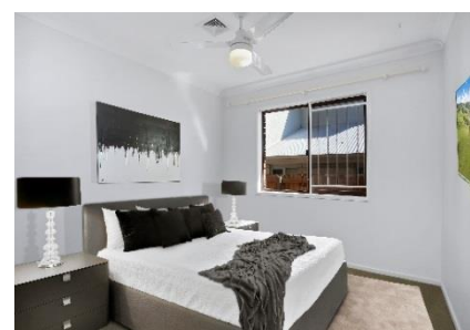
53 Haig St Wynnum West