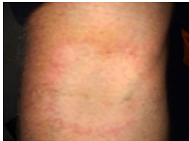
Figure 1: 26th March 2021 - Heat Rash of worker