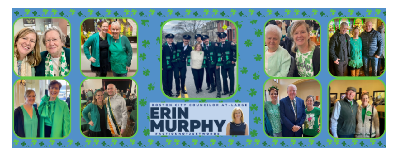
South Boston Boys & Girls Club