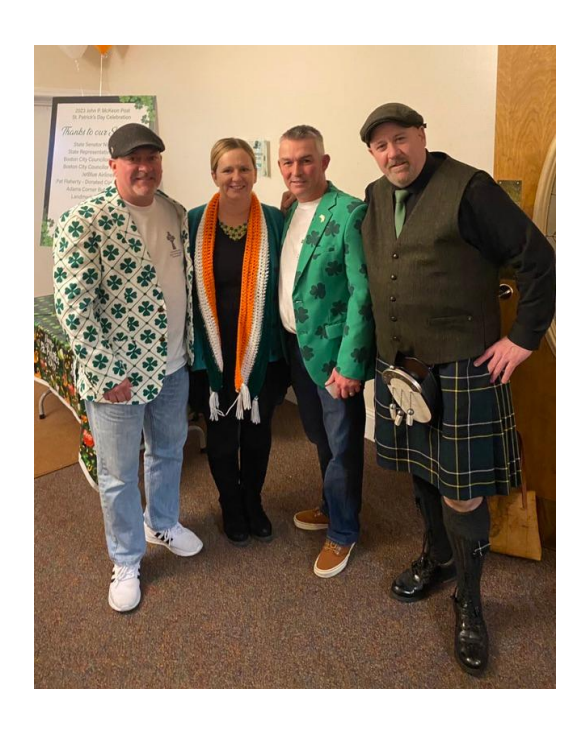
Fun time with friends at the 2nd Annual St. Patrick's Day Party. All proceeds benefit the McKeon Post Scholarship Fund.