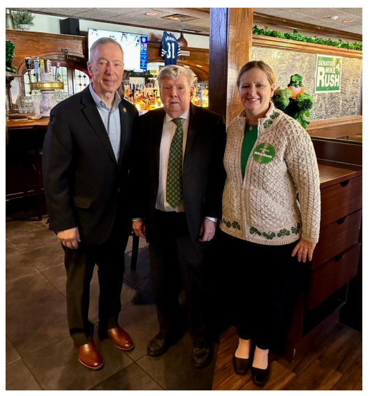
Happy to start the day off in West Roxbury with neighbors celebrating Senator Rush. Enjoying delicious breakfast at the Corrib and great Irish music from Curragh's Family is always a delight.