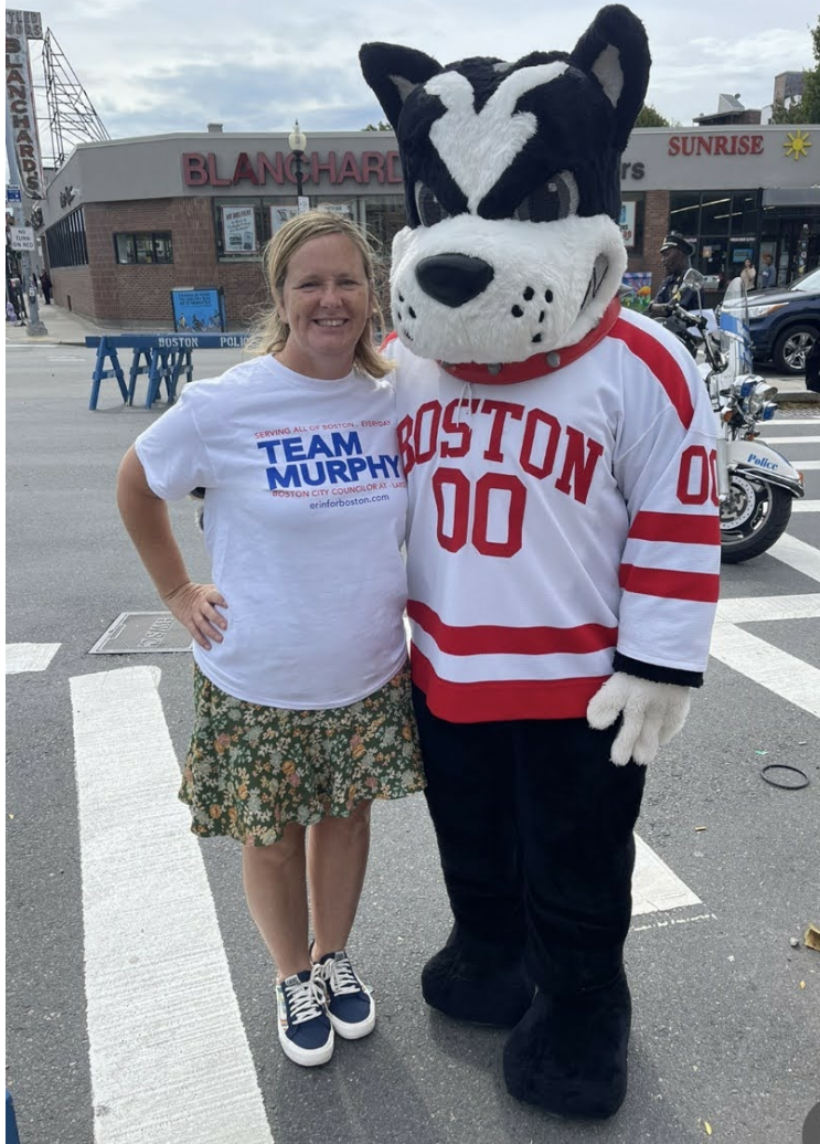
The official mascot for Boston University is Rhett. Their team nickname is the Terriers, so it seems fitting that they would have a Boston Terrier for a mascot. Fun fact: The school colors are Scarlet and White. The mascot is named Rhett after Rhett Butler from Gone With the Wind, because "no one loves Scarlet more than Rhett."