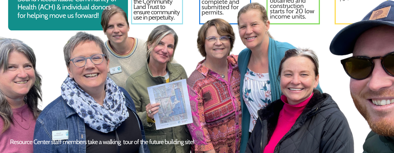
Resource Center staff members take a walking tour of the future building site!