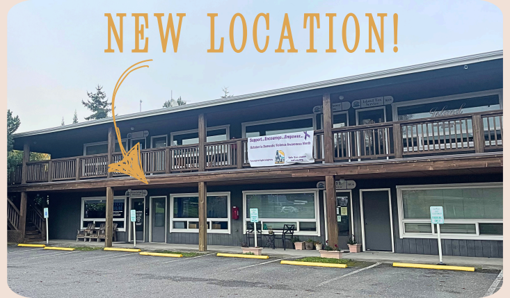
New Dental Clinic space at 1286 Mt. Baker Rd. - Airport Center