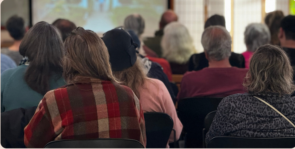
Pictured: "Building a Stable Community" event guests engaged in the video presentation

In October, the Orcas Community Resource Center hosted "Building a Stable Community," at the Orcas Island Public Library. This gathering united community members, local leaders, and mental health experts to discuss potential partnerships, systemic barriers to stability, and ways to enhance community resilience. The event also highlighted the Resource Center's essential services and future plans.