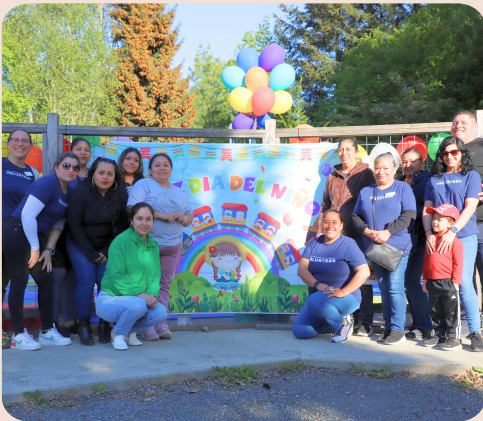
Pictured: Dia De Los Niños volunteers

The Resource Center's Bilingual Community Health Worker (CHW) Program plays a transformative role in connecting Spanish-speaking residents with essential health and social services. This trusting relationship allows CHWs to bridge gaps in service, facilitate access, and advocate for high-quality, culturally competent care. The program is especially impactful within the Latinx community, which comprises 16.5% of islanders we serve—a figure that has grown significantly from last year.