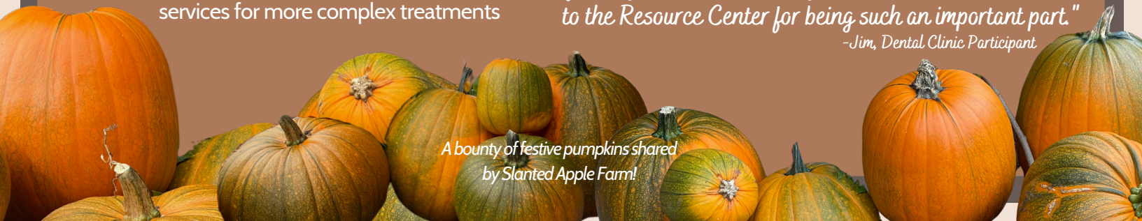
A bounty of festive pumpkins shared by Slanted Apple Farm!