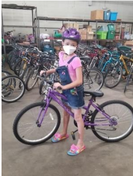
Bike Rodeo 2021