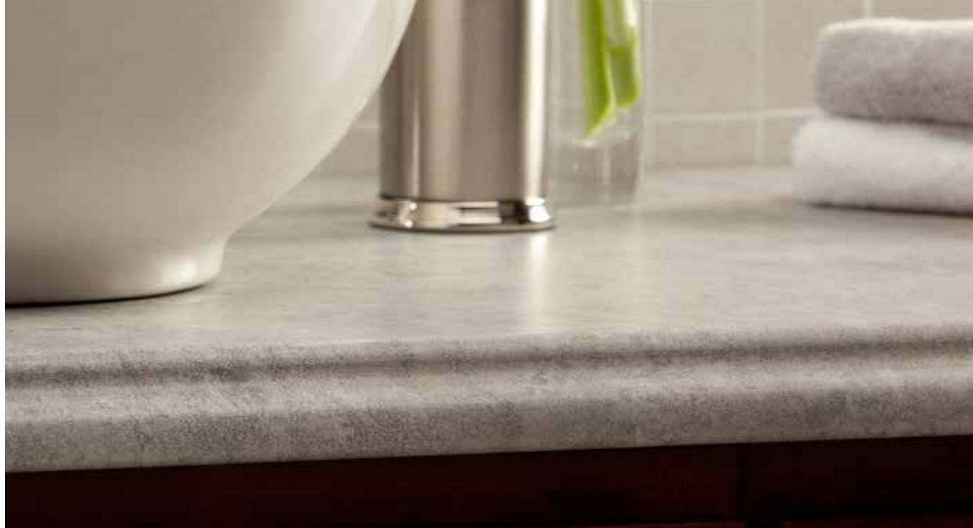
Edge: Afton Laminate: Elemental Concrete Formica® 8830-58

One source. Many beautiful looks. Only from VT.