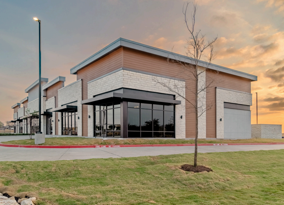
*Images shown are from a recently completed retail center by 1ONEFirm, Inc. in McLendon Chisholm, TX.