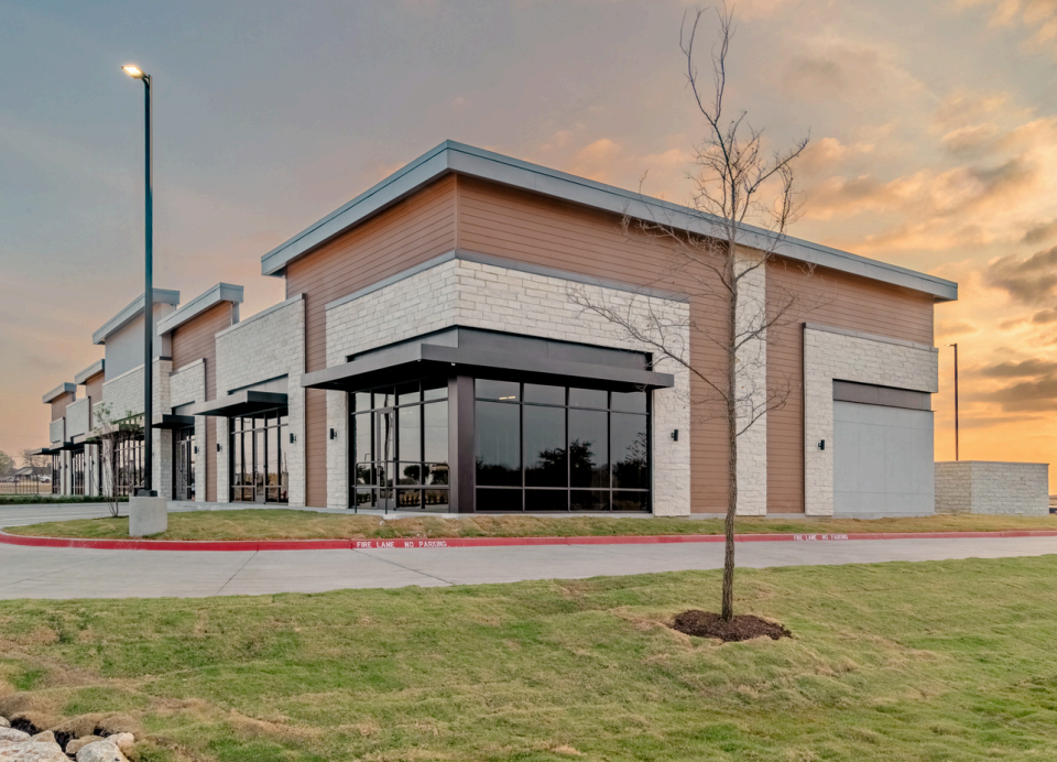
*Images shown are Village of Chisholm -Phase 1