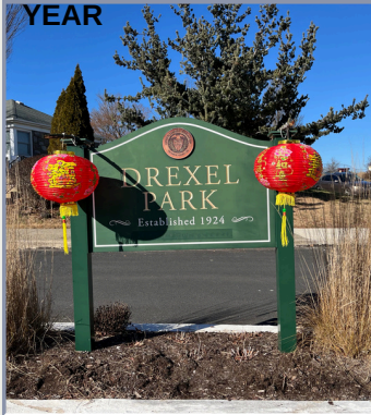
SIP AND LEARN