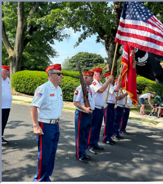
4TH OF JULY