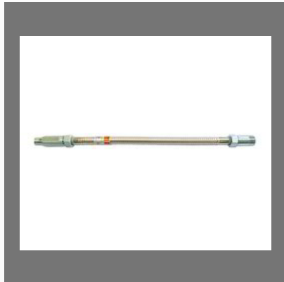
Unbraided Flexible Sprinkler Hose