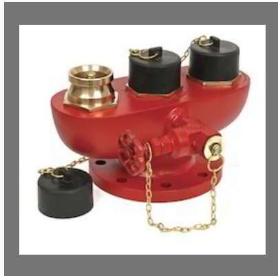
Three Way Inlet Breechings