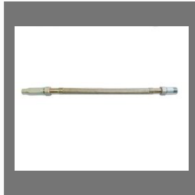
Braided Flexible Sprinkler Hose