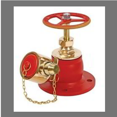
Single Hydrant Valve