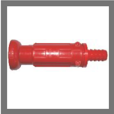
PVC and ABS Nozzles