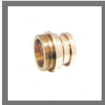
Threaded Male and Female Adaptors