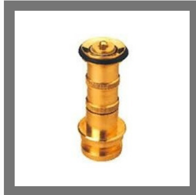
Navy Type Branch Pipe