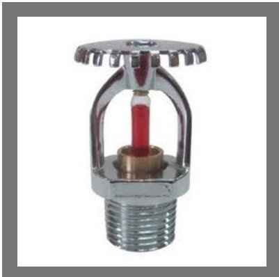
Upright Type Sprinkler