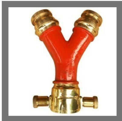
Dividing And Collection Breeching