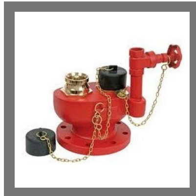
Two Way Inlet Breeching