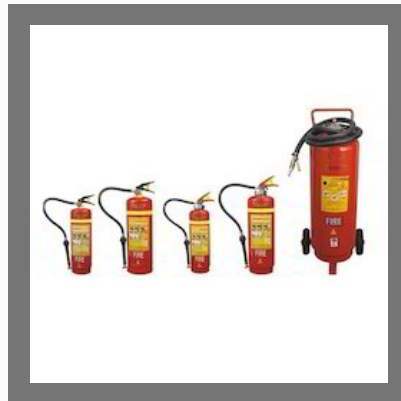
Mechanical Foam Type Fire Extinguisher