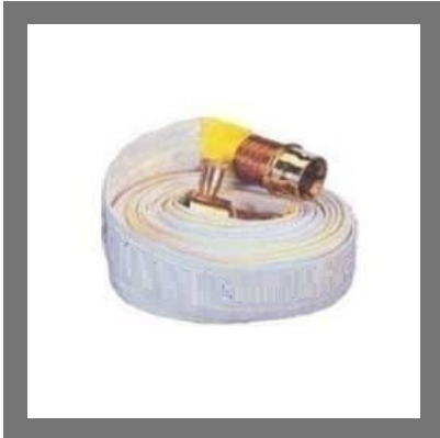
CP Hose Pipe