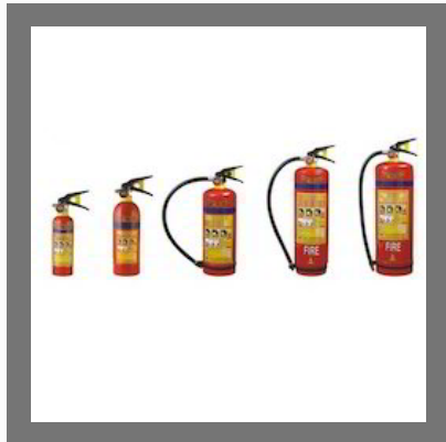
ABC Fire Extinguisher