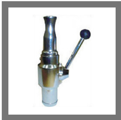
Bronze Nozzle Hose Reel