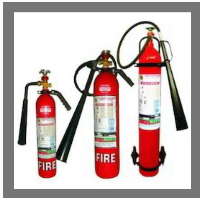
Carbon Dioxide Fire Extinguisher