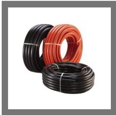
Hose Reel Hose