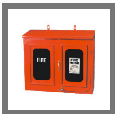
Double Door Hose Box