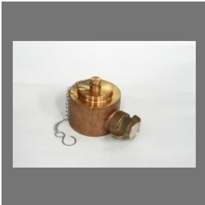
Blank Cap and Plugs