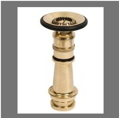
Triple Purpose Branch Pipes