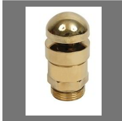
Air Release Valve