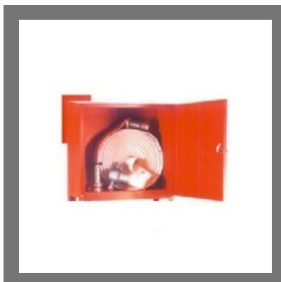
Single Door Hose Box