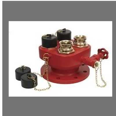
Four Way Inlet Breechings