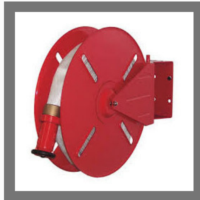
Wall Mounting Type Hose Reel