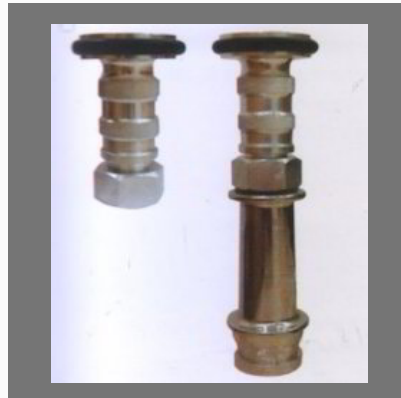
Jet Spray and Shut Off Nozzle