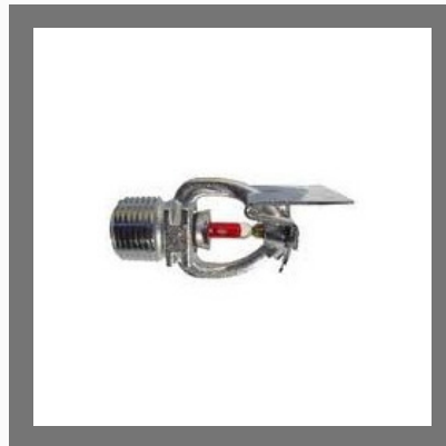
Side Wall Type Sprinkler