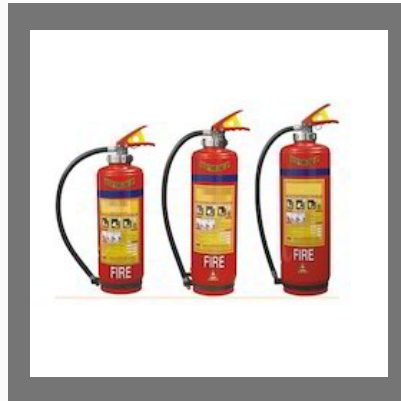
Dry Chemical Fire Extinguisher